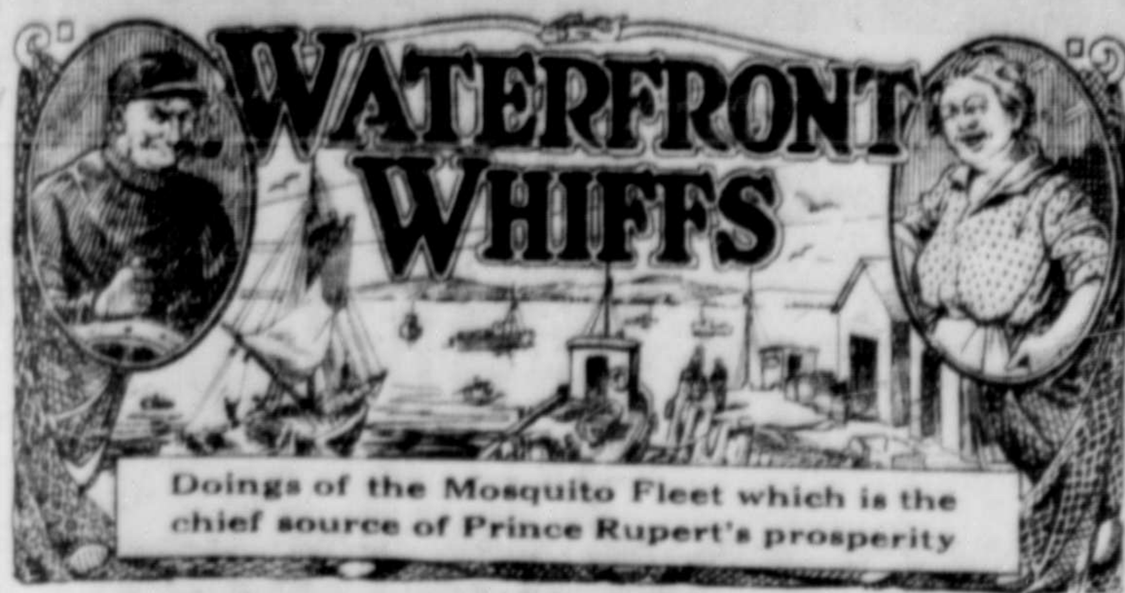
Doings of the Mosquito Fleet which is the chief source of Prince Rupert's prosperity

There is one spot in the city where business is humming, where the fish buyers have been having a strenuous time. That spot is along the waterfront.