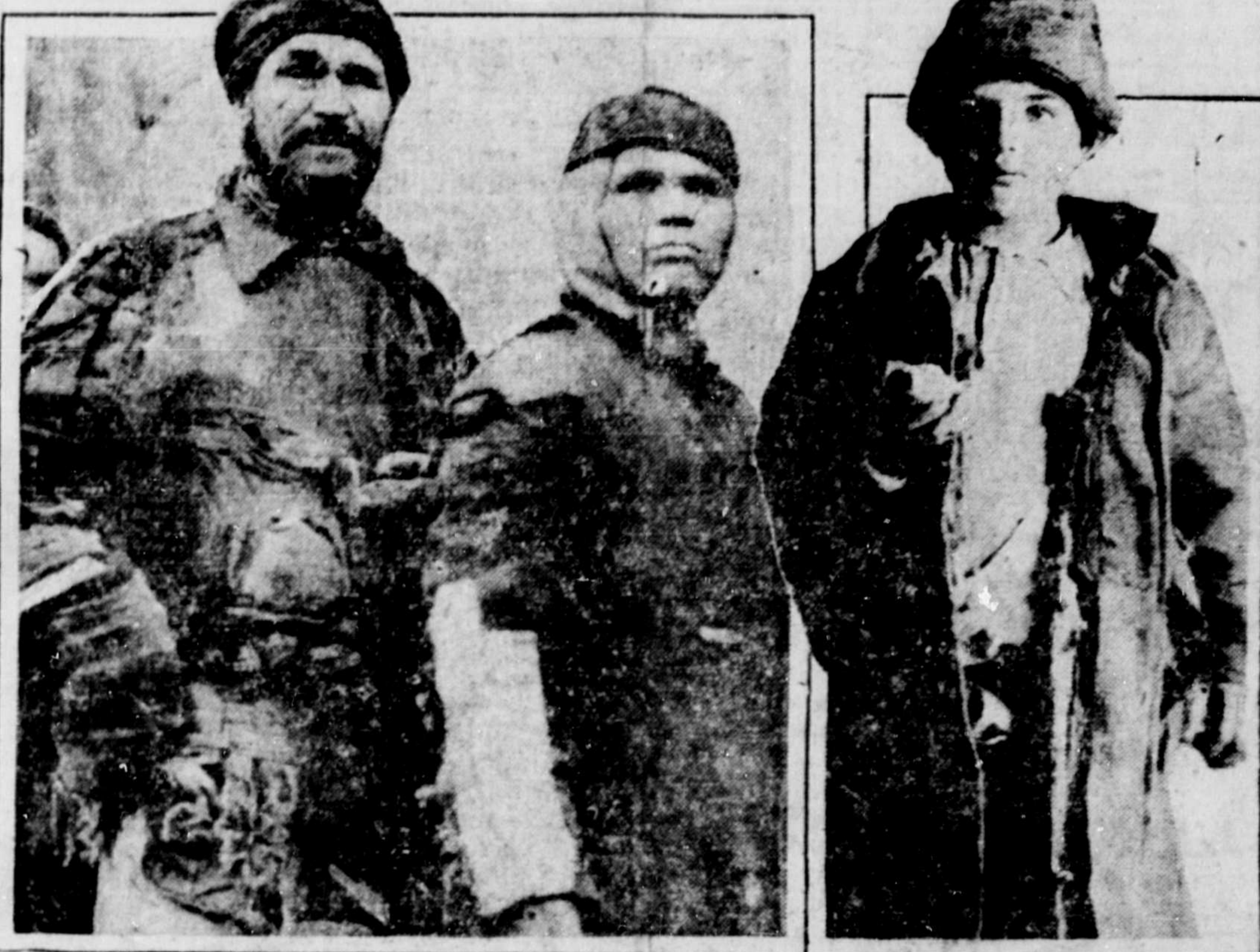
These two exclusive pictures show the condition that Russia is in to-day. The picture on the right, taken in Moscow, shows the midwinter dress of a Russian boy from the famine district. He arrived in Moscow after a three months' tramp in his search for betterment and food. The photograph on the left shows two Tartars from the Kazan famine area, who have made their way to Petrograd only after suffering practically intolerable hardships. Oftentimes they had to go three or four days without a morsel of food.