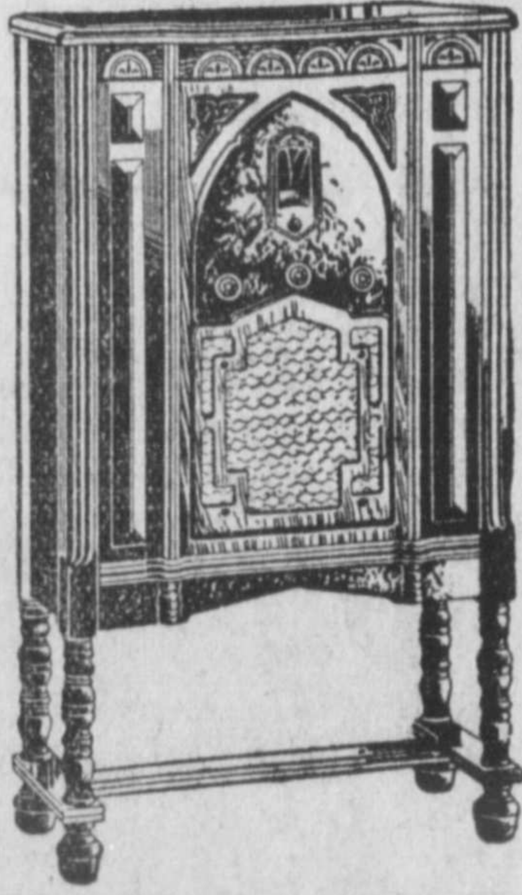
8 Tube Console Model. Super-Heterodyne Circuit.