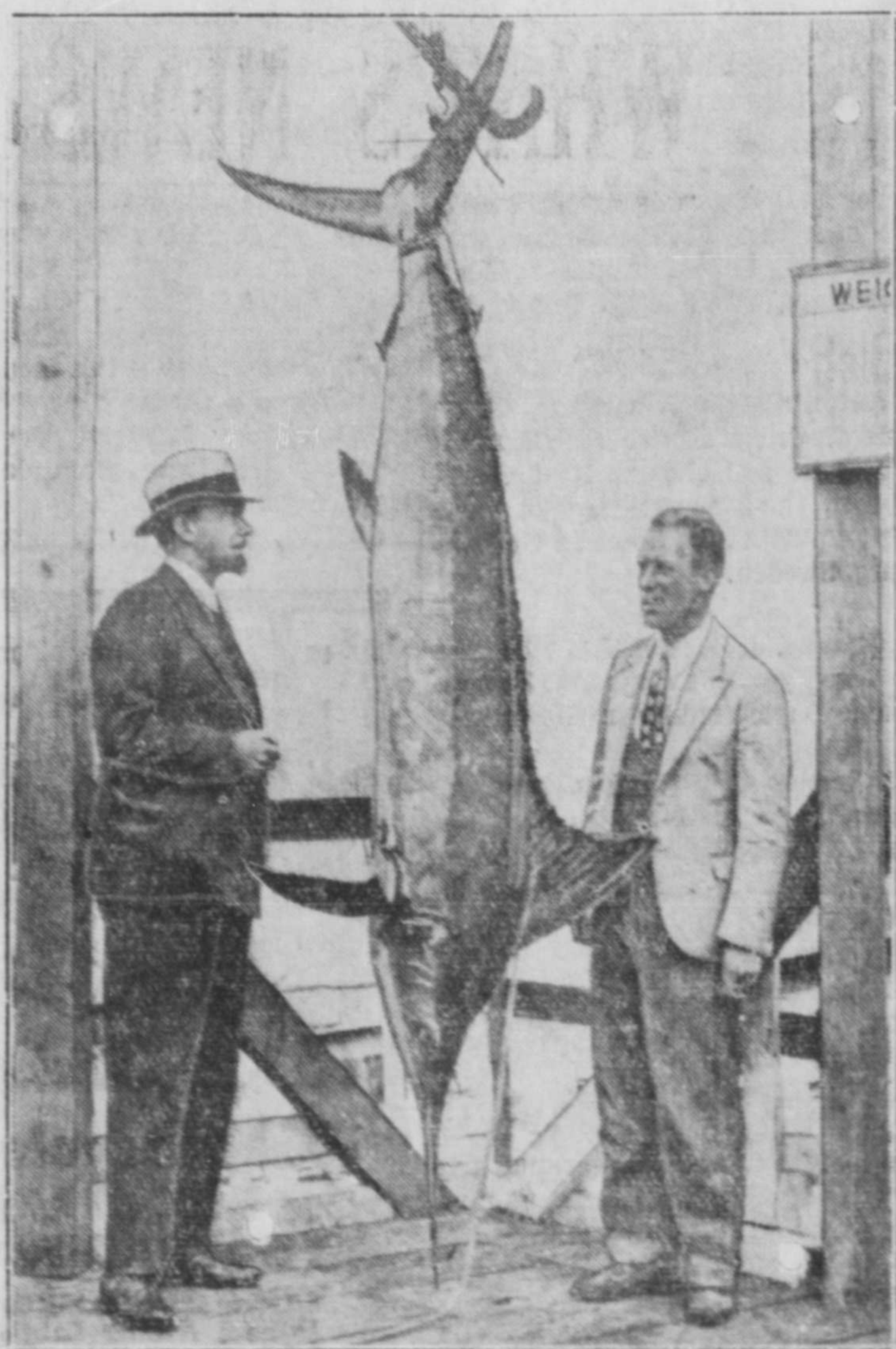
The combined adventures of the two men would fill a book, but they never indulged in deep-sea fishing until recently in California. Sir Hubert Wilkins, who bobbed in a pole-going submarine last year, and Frank Hawks.