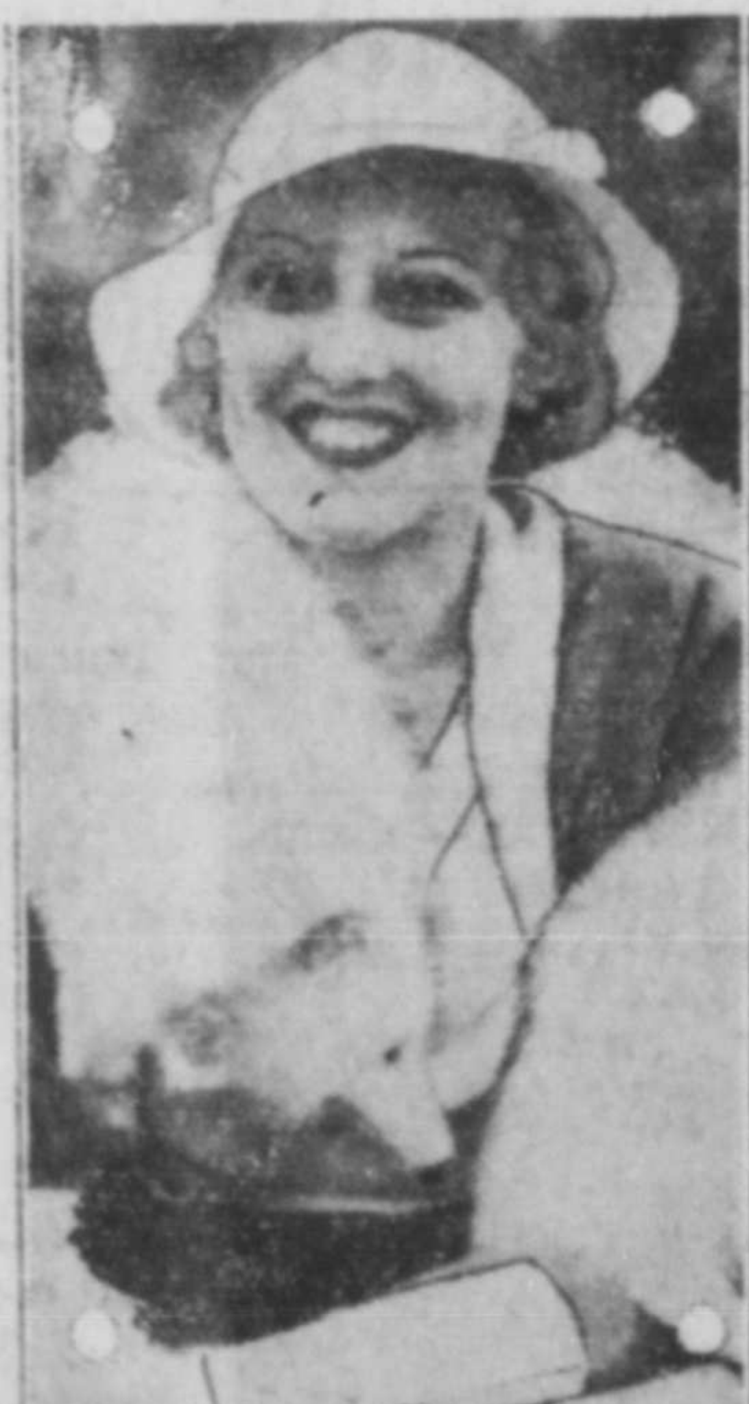
One of stars of "Speak Easily" at Capitol Theatre.