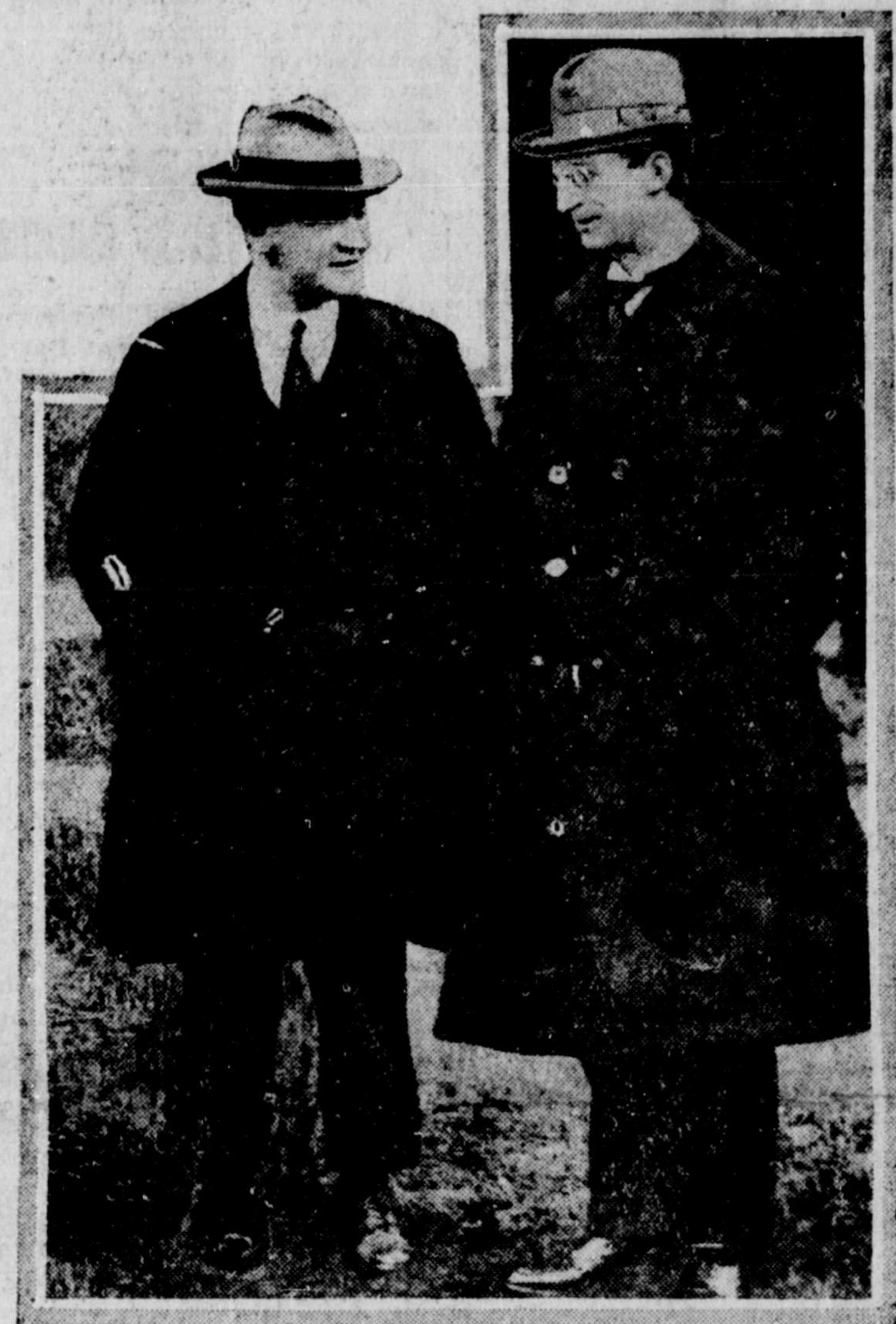
FIRST POSED PICTURE OF DE VALERA AND MICHAEL COLLINS.

The meeting of the Sinn Fein Ard Echeis at the Dublin Mansion House aroused exceptional public interest not only in England and Ireland but in the United States as well. Delegates from all parts of Ireland, including Ulster, were present. Eamonn de Valera presided at the meeting. This photograph, taken outside the Mansion House, shows Michael Collins, President of Sinn Fein, and Eamonn de Valera, "all smiles." While both are bitterly opposed politically, they are great friends otherwise. This is thought to be the first posed picture ever taken that shows the two leaders of the belligerent factions together.