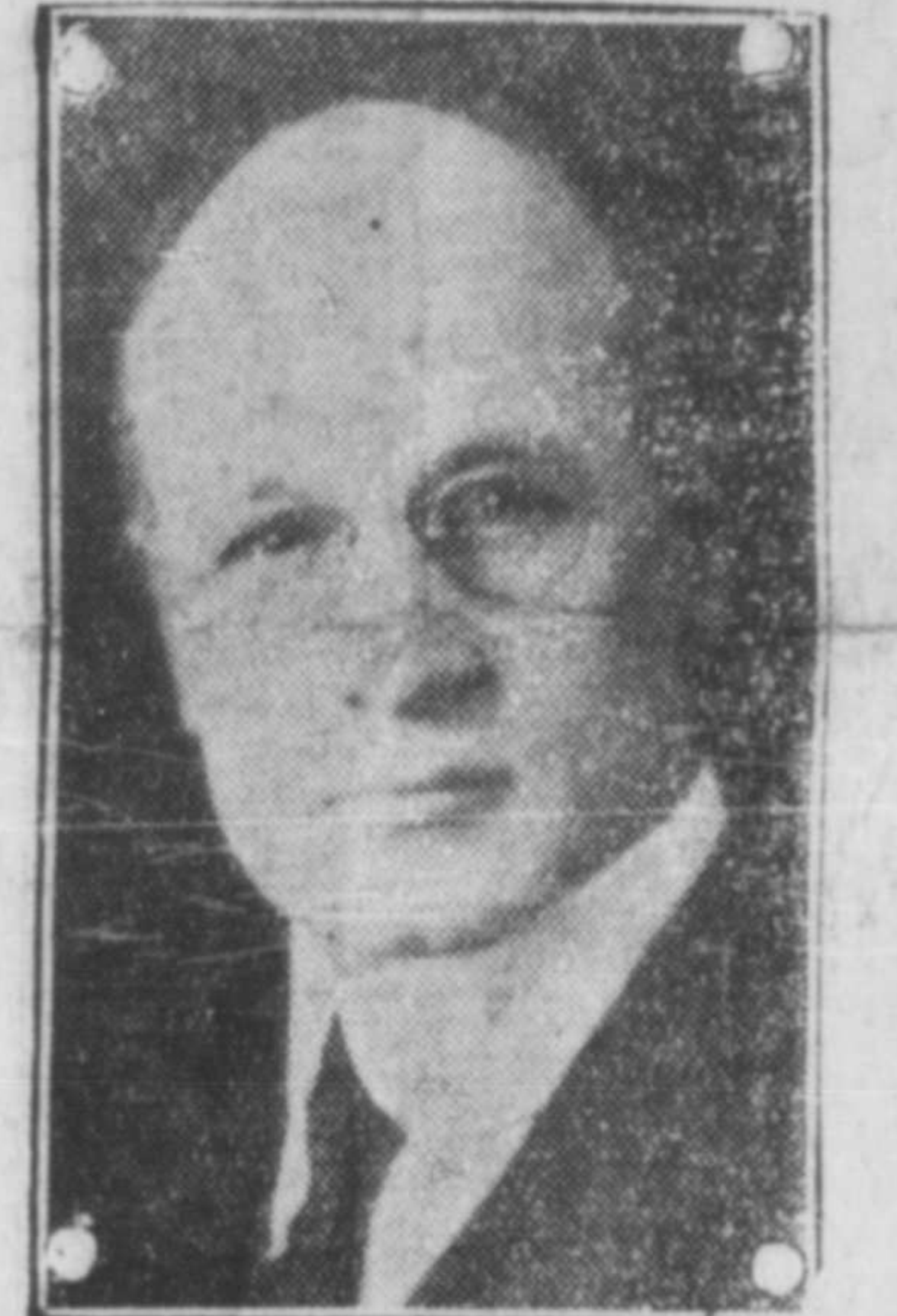
Hon. H. H. Stevens, who says Canadian government is concerned over exchange on British pound.