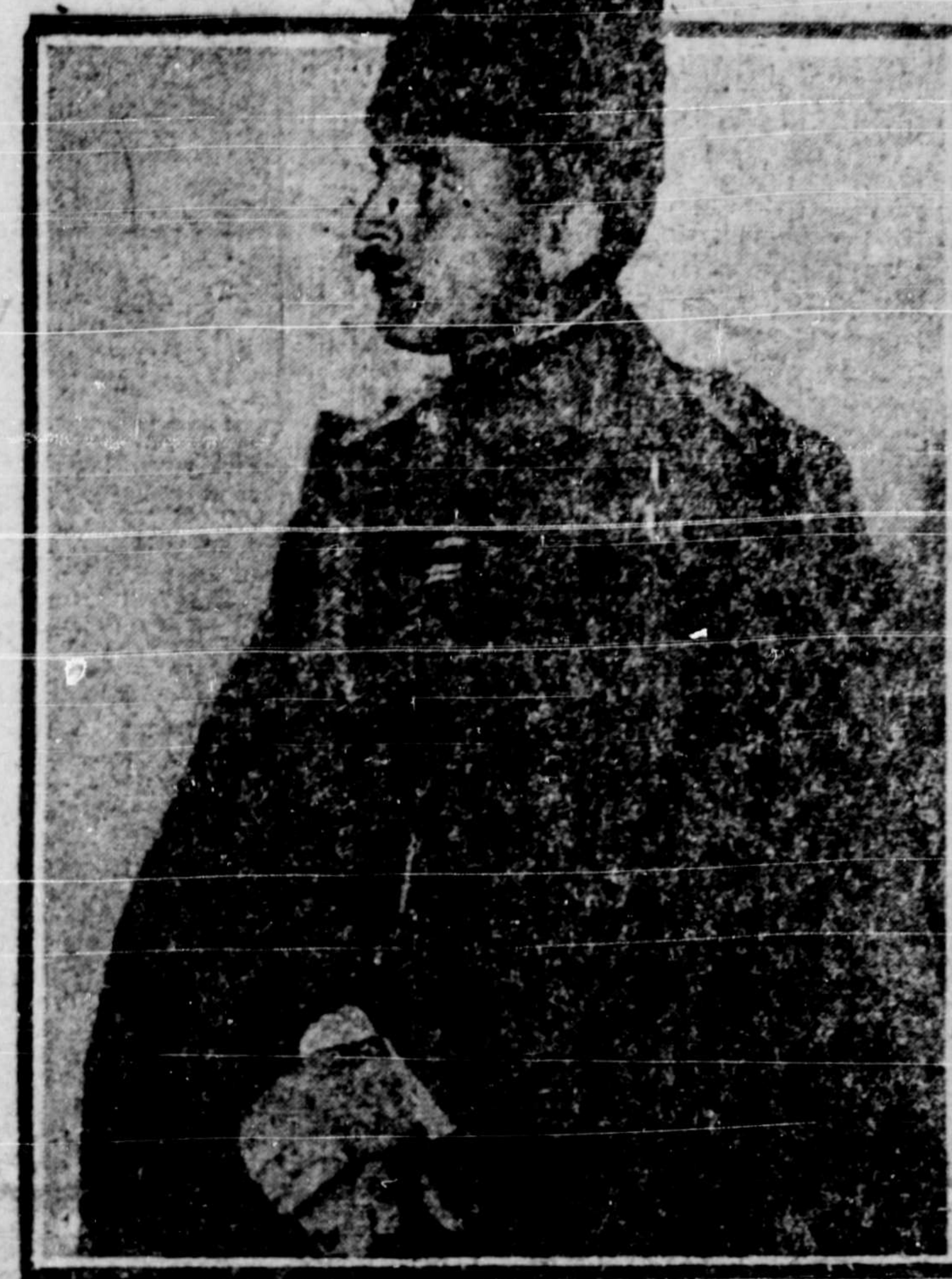
Enver Pasha, the young Turkish chief who is reported to be active in conducting Bolshevistic agitation in the Caucasus for the purpose of marching into Anatolia, overthrowing the Nationalists' Government and proclaiming a Soviet dictatorship.