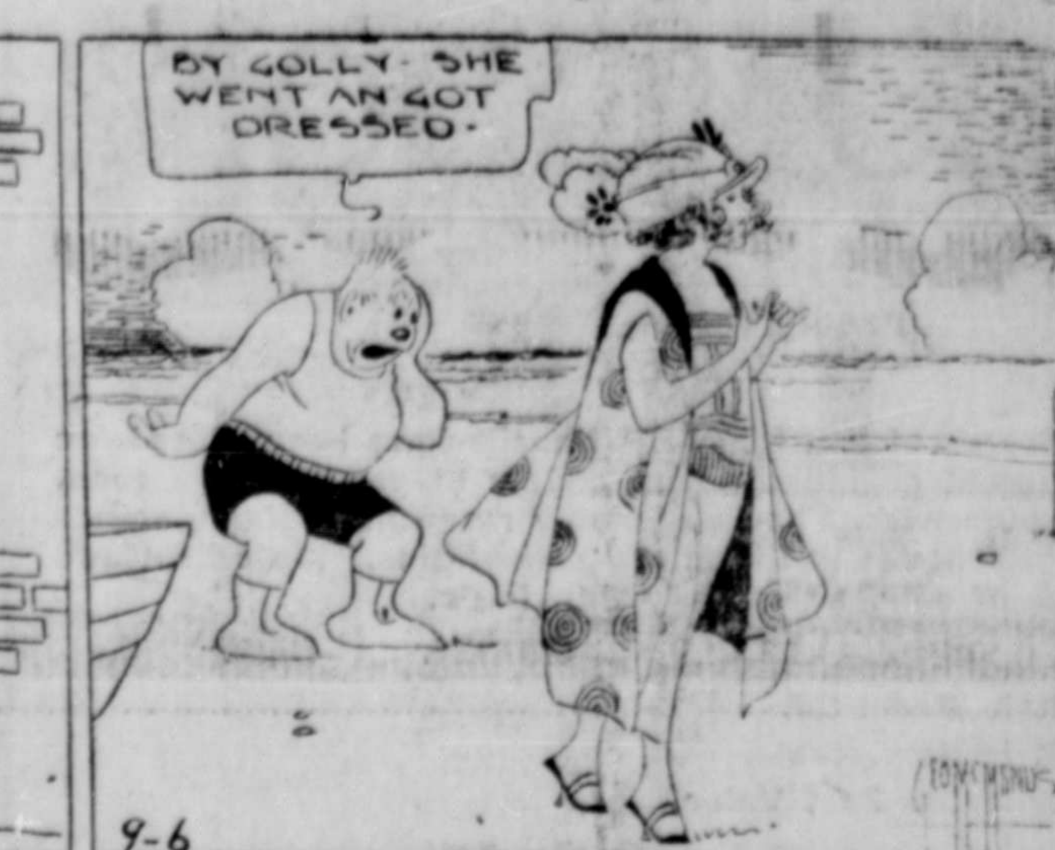
© 1922 BY INT'L. FEATURE SERVICE, INC.