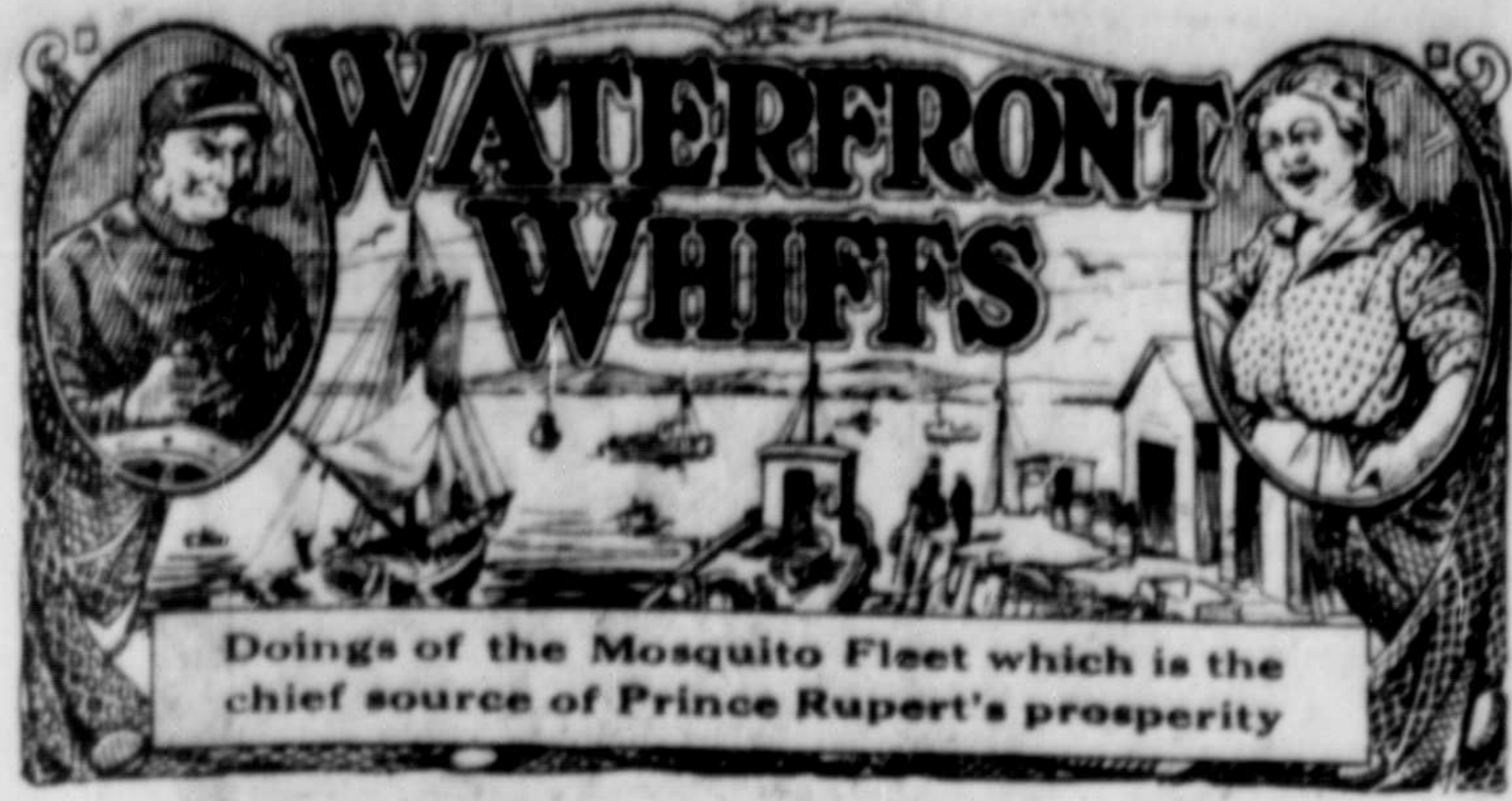
Doings of the Mosquito Fleet which is the chief source of Prince Rupert's prosperity

The secretary to the Admiral reports that the weather has again been particularly rough and juicy on the high spots and as a consequence the fish arrivals have been light.