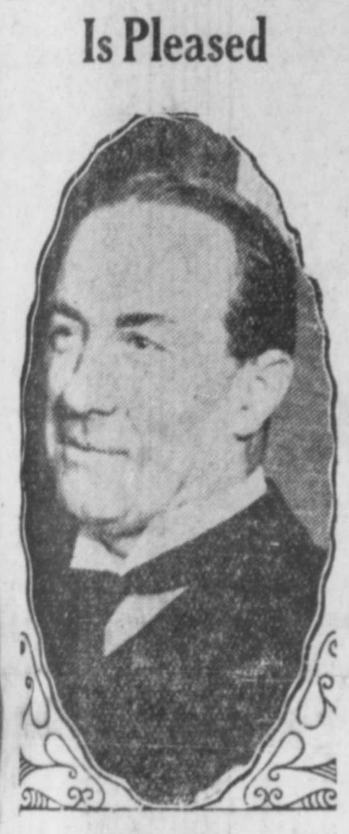
Rt. Hon. Stanley Baldwin who comments favorably on election of Franklin Roosevelt as president of United States.

More Time To Meet Their War Debts Asked of United States By Great Britain and France