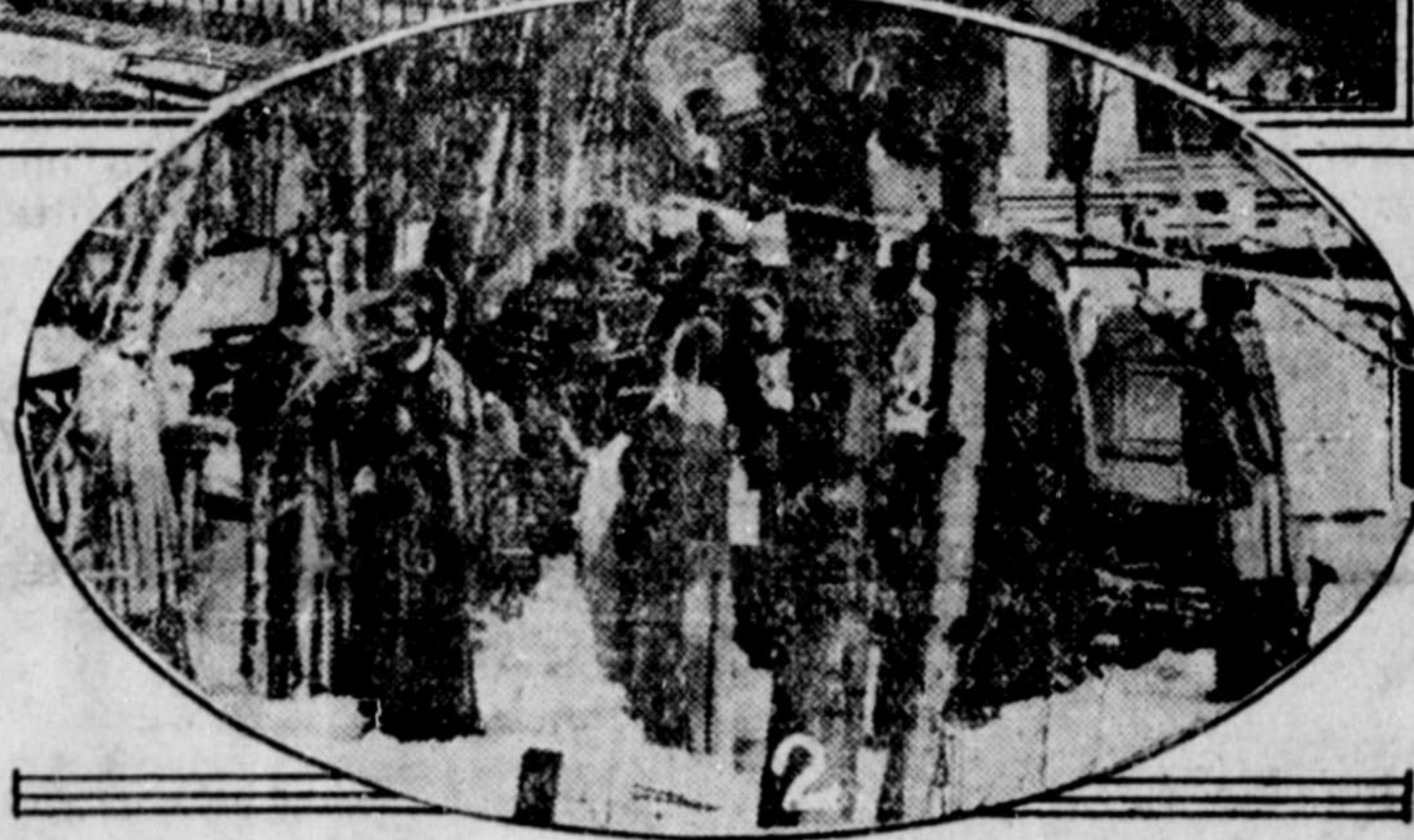
sacristy, between the church and the monastery, and spread both ways. Photograph No. 2 shows the statues rescued from the flames, including the one of Saint Anne, deposited in the snow