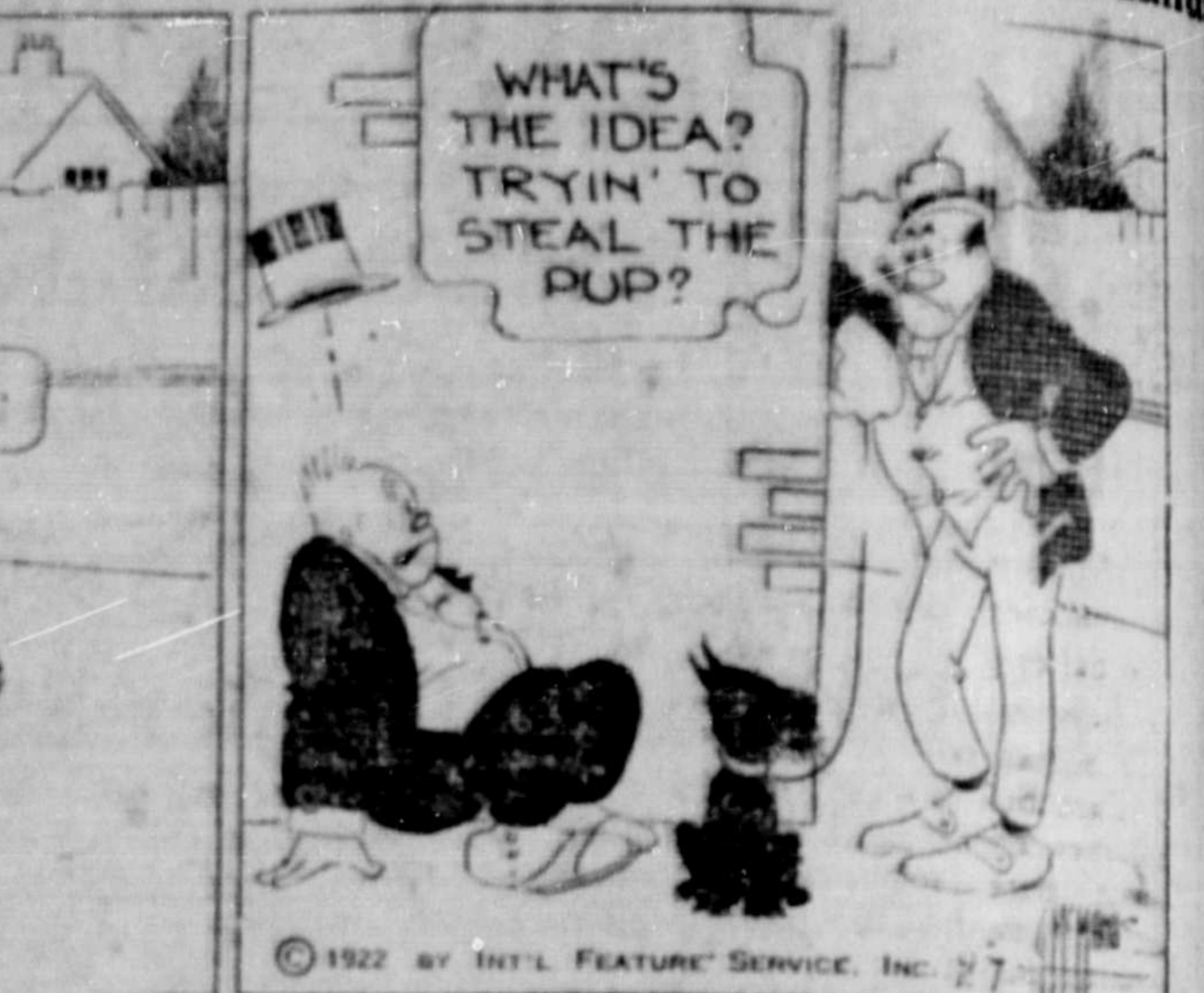
© 1932 BY INT'L FEATURE SERVICE, INC. 27