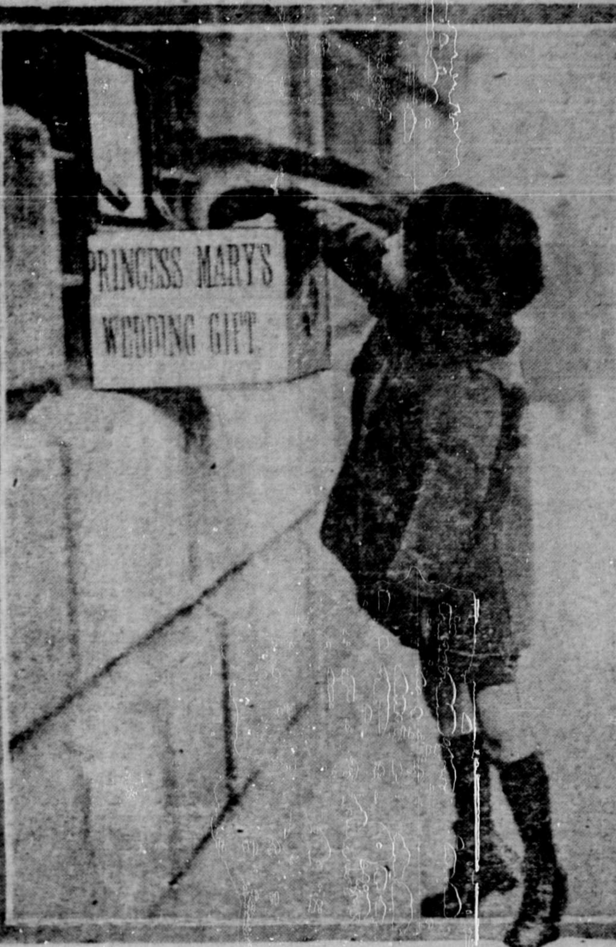
A young Londoner putting his contribution into the collection box outside of the Mansion House, where all London is depositing coins for the Lord Mayor, who will present a suitable wedding gift to Princess Mary in the name of the citizens of London.