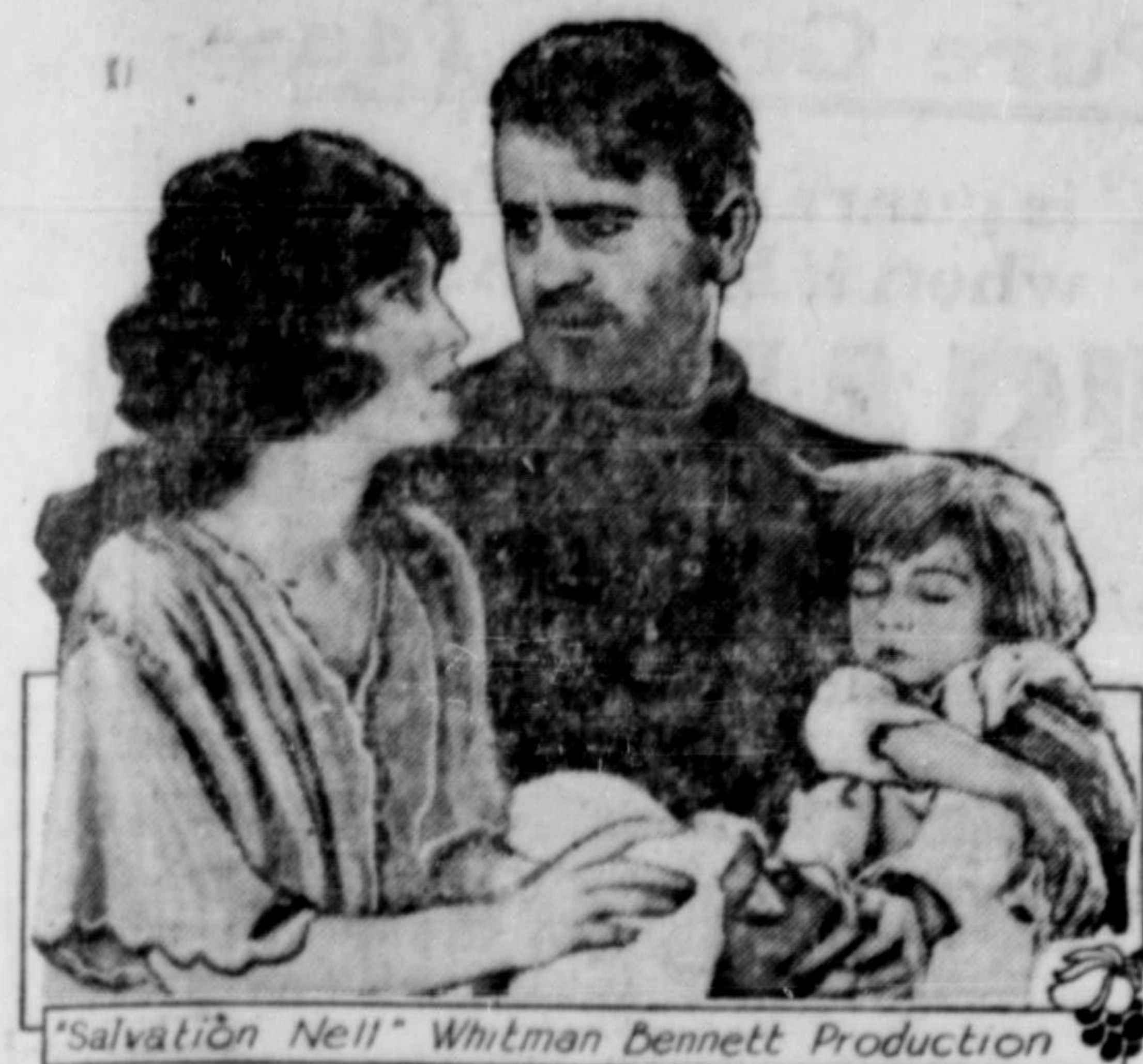
"Salvation Nell" Whitman Bennett Production