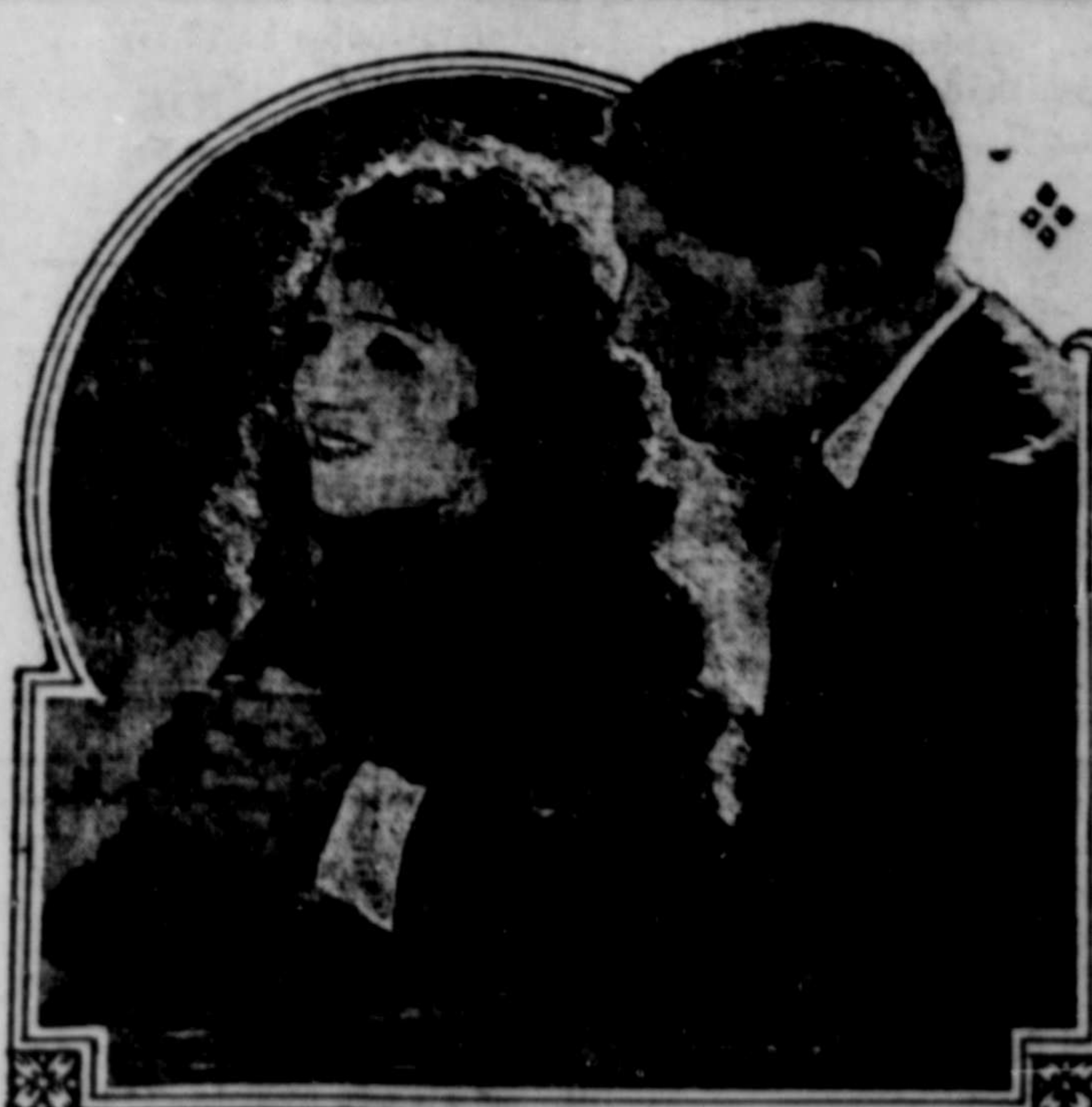
Bebe Daniels in "Nancy from Nowhere" Realart Pictures

At Westholme Theatre Friday and Saturday.