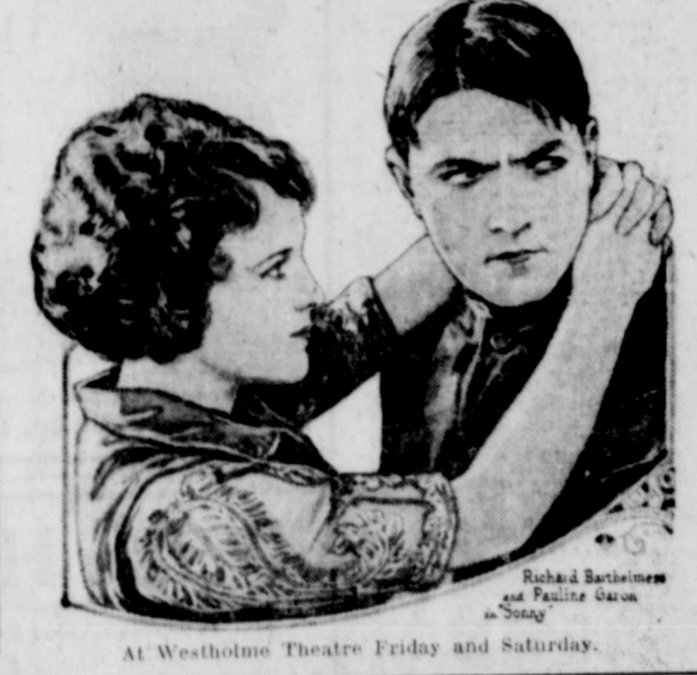
Richard Barthelmess and Pauline Goddard in "Sonny" at Westholme Theatre Friday and Saturday.

Vicente Blasco Ibañez, author of "The Four Horsemen of the Apocalypse," saw his story in the films at the Teatro Royal in Madrid, Spain, recently. He expressed complete satisfaction for "the magnificent manner" in which his story was translated to the screen. Ibañez' latest