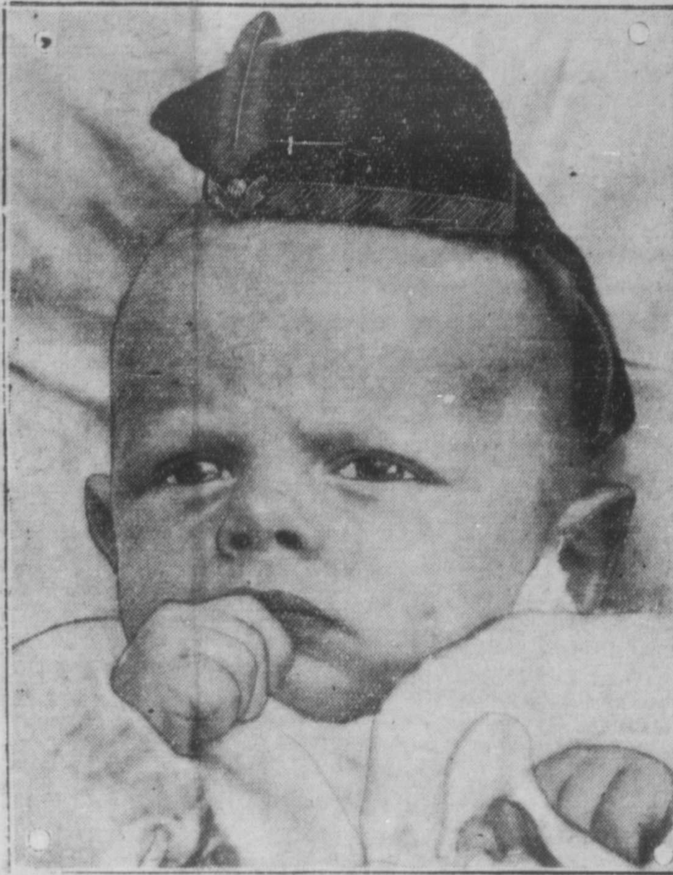
"Aye, Mannie, but whar's my ba'wees?" This dour wee Scottie evidently takes the baby contest business very seriously. Note the tight little fist.