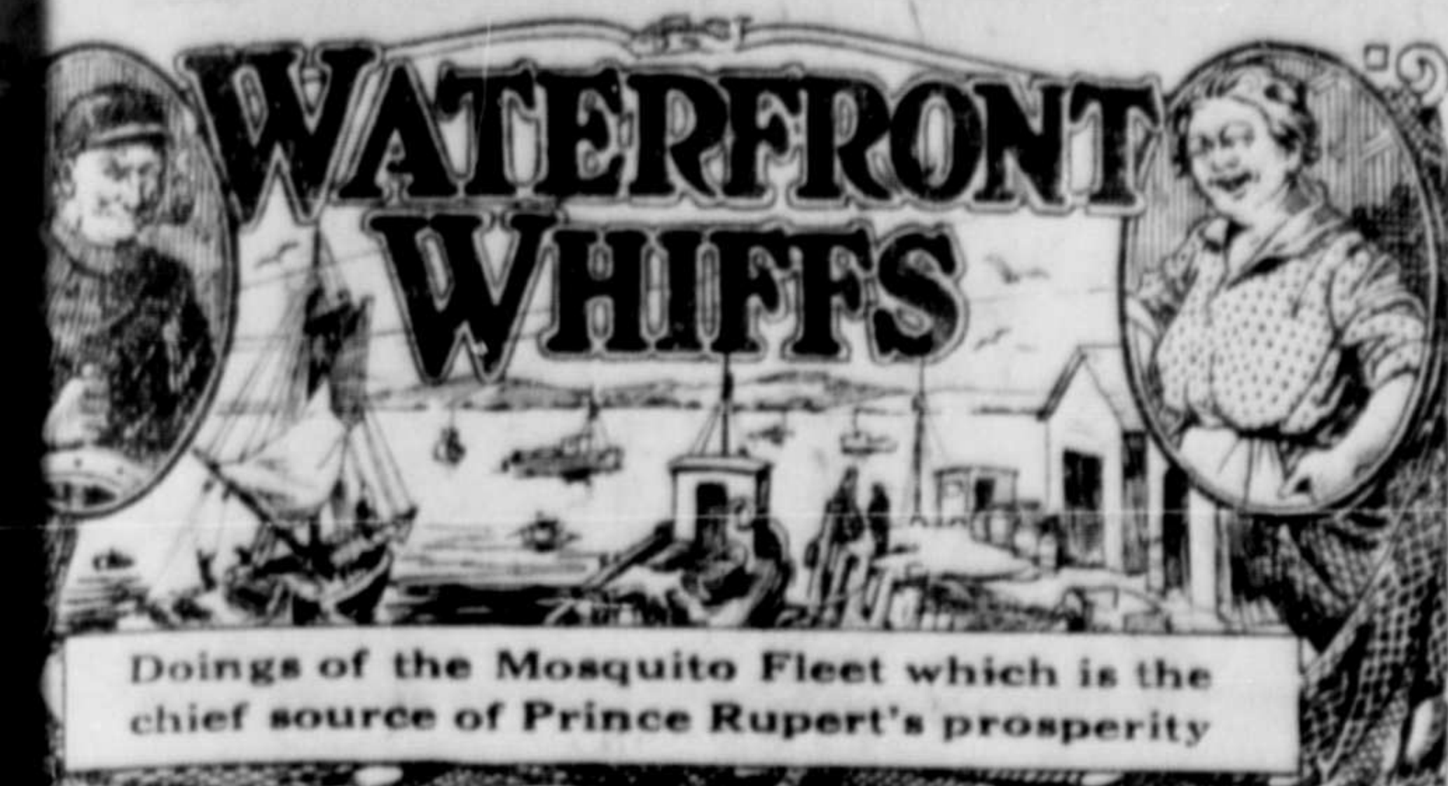
Doings of the Mosquito Fleet which is the chief source of Prince Rupert's prosperity