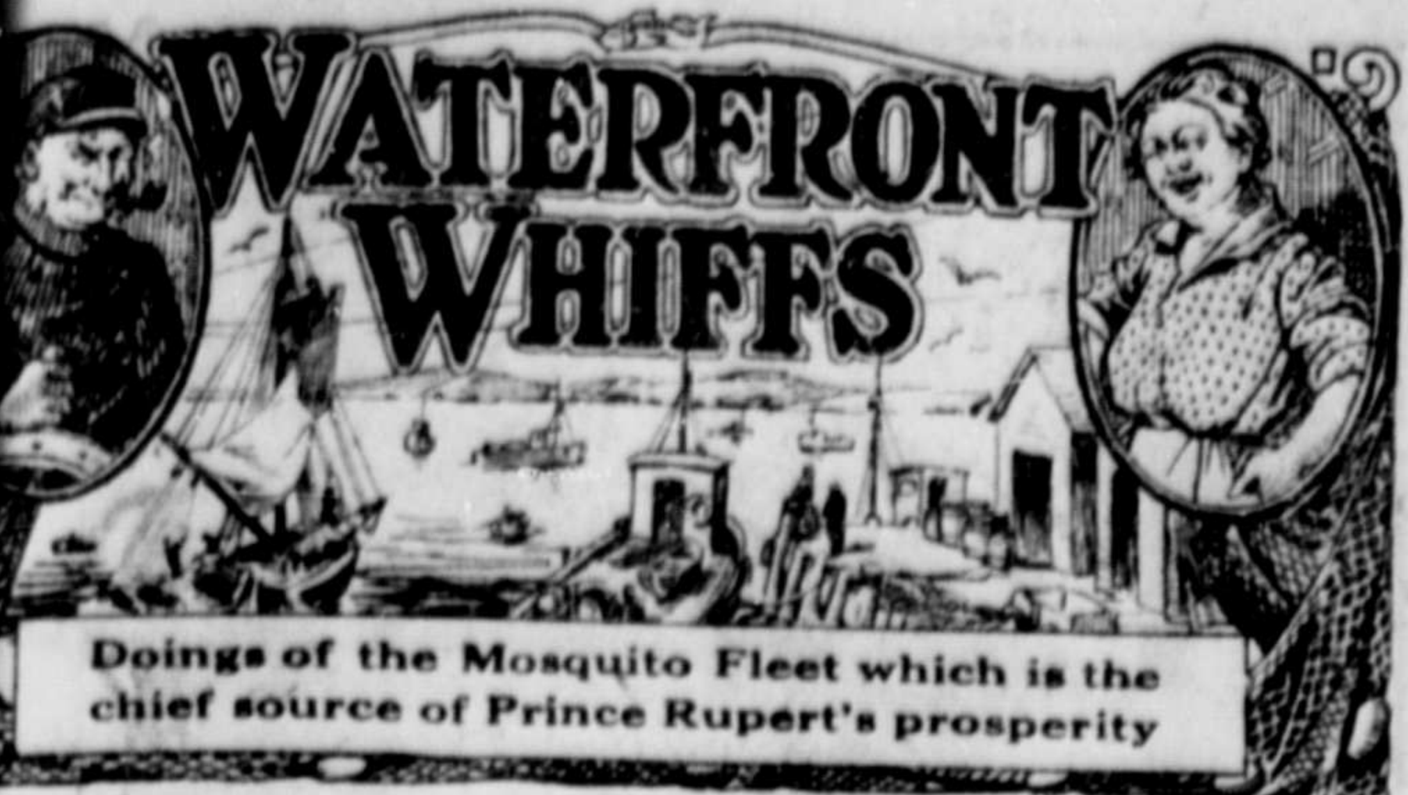
Doings of the Mosquito Fleet which is the chief source of Prince Rupert's prosperity

Admiral of the fleet, who returned to port from a long cruise of inspection, reports that the fish arrivals this week are to the old stride and that the landings have been made, in fact he can now tell the difference between a cat skin and a buffalo hide. Among other things Cap got a Catawampus skin, one of the finest species of the feline tribe only found in Dead Man's Hollow. The Catawampus hide measures some 12 feet by 6 feet beam and is valued at well it doesn't matter.