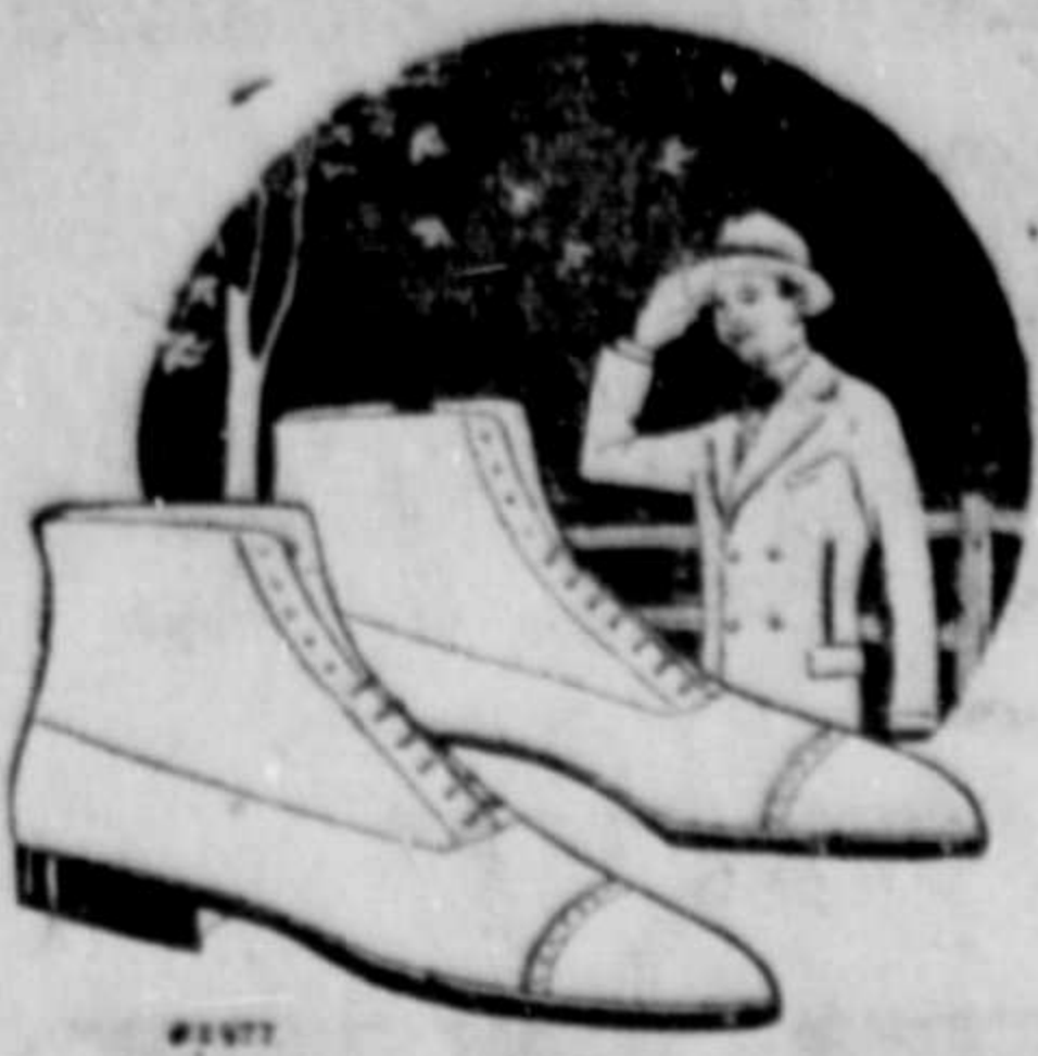
SPRING IS IN THE AIR.

See Our Latest Models in Spring Footwear Our Range in Qualities and Prices is the Largest in the North