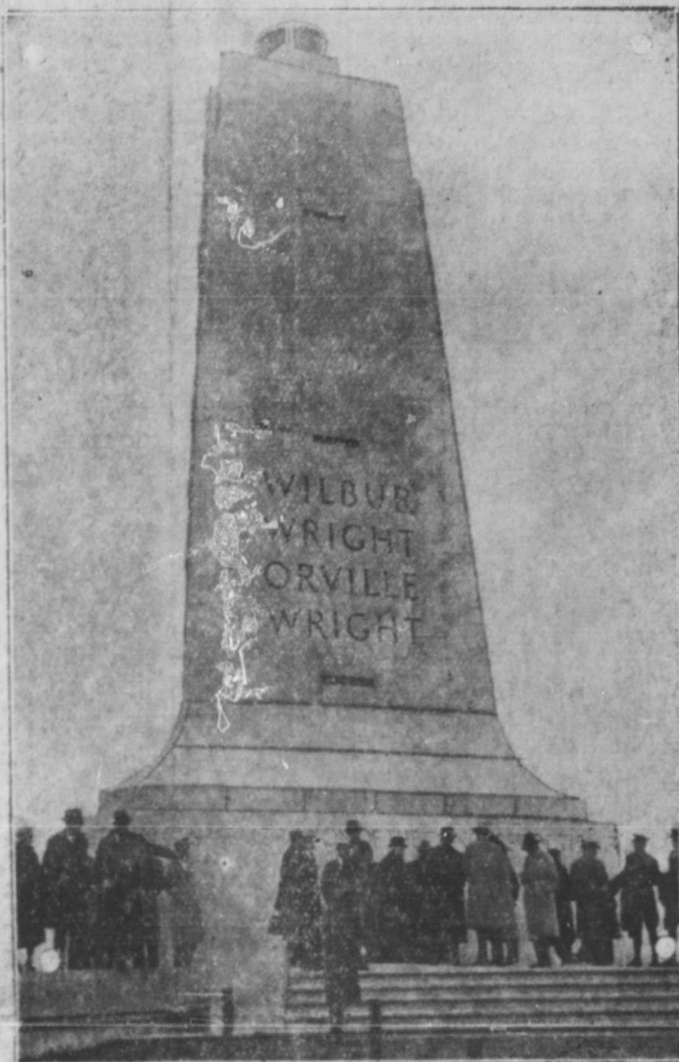
Wright memorial dedicated. Commemorating the first flight made by Wilbur and Orville Wright in December, 1903, a 150-foot granite column was recently dedicated at Kitty Hawk, N.C. Orville attended—his brother is dead.