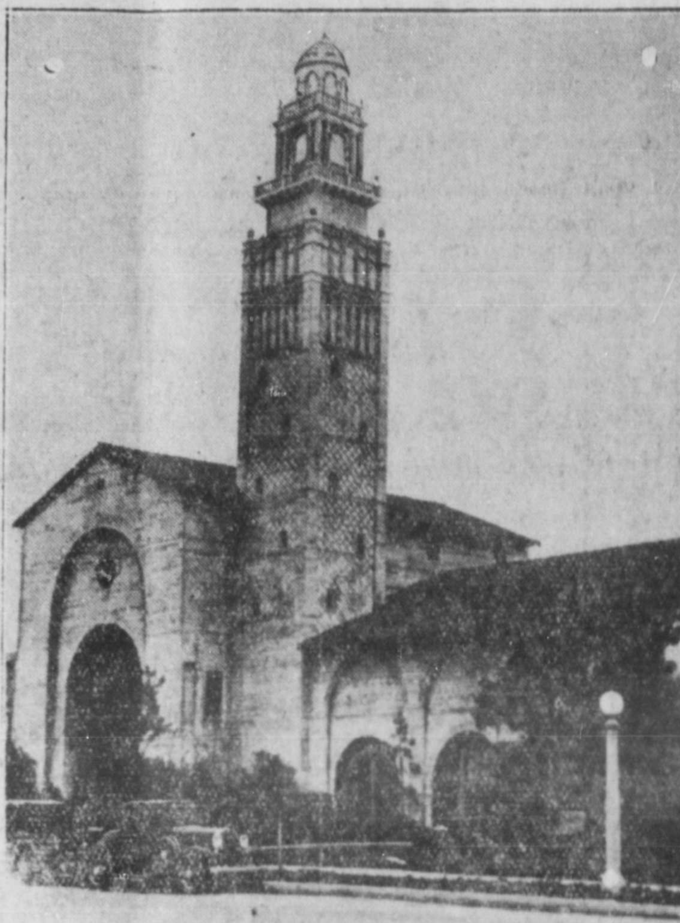
Three guesses and you're still wrong. No church, home or city hall this but the swanky sewage disposal plant of Beverly Hills, California, where the grand manner is applied to all things.