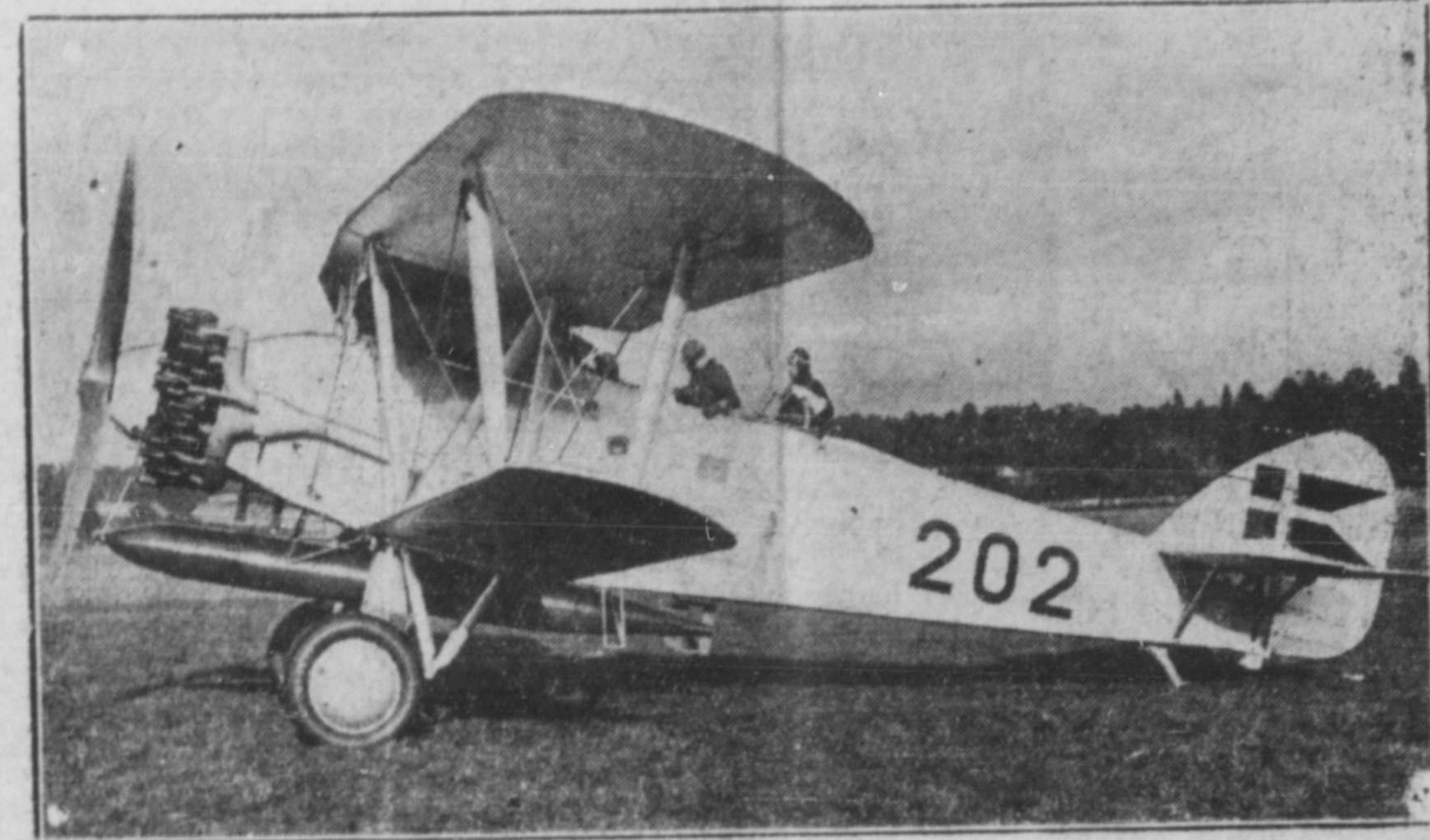
The Danes Haven't been in a scrap since Hector was a pup and have no warlike notions now. Just the same, they believe in protection and a fleet of these powerful Hawker Armstrong-Siddley torpedo aeroplanes has been ordered from England.