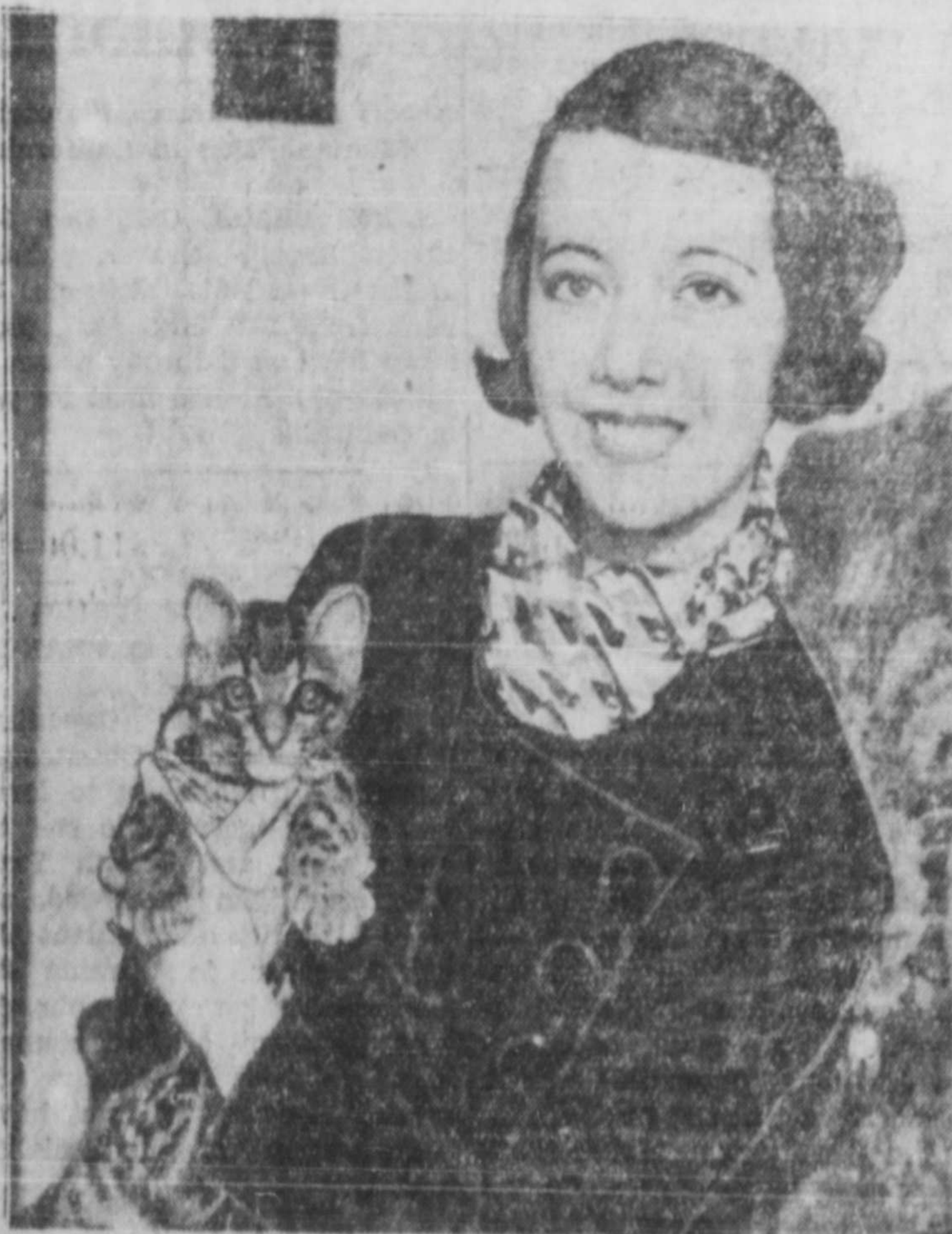
This kitty bites! Lily Pons, diminutive French opera star, as she arrived at San Francisco with her pet jaguar. Lily may join the movie colony.