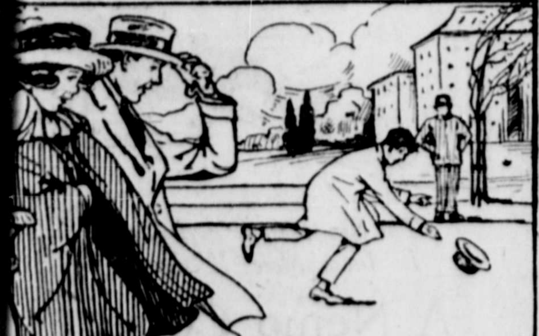
"When the stormy winds do blow"