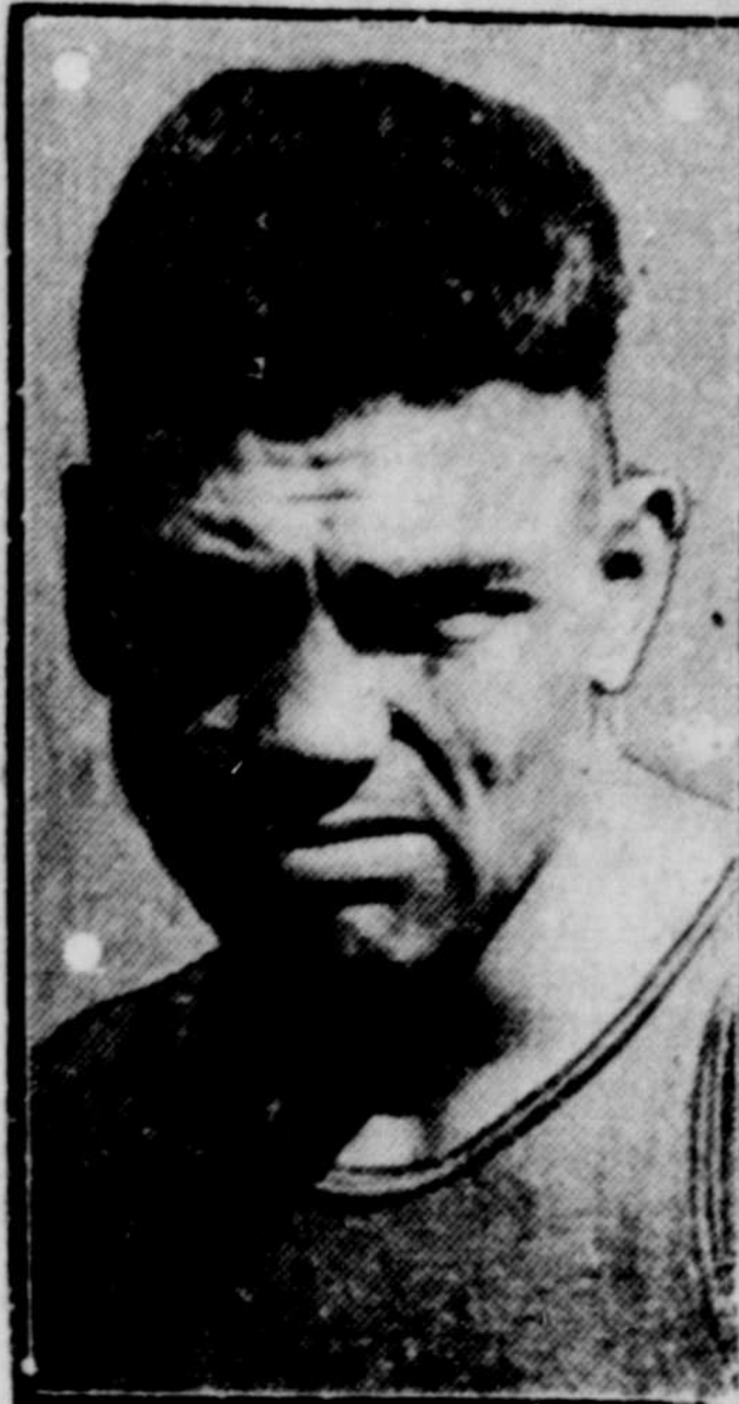
Most boxers prefer to meet Mr. J. Dempsey socially rather than any other way. His facial expression may have something to do with this.

Pittsburg 3, Brooklyn 2, Chicago 9, New York 5. American League Washington 2, Detroit 10, New York 4, Cleveland 2, Philadelphia 3, Chicago 1, Boston 0-6, St. Louis 11-6, Eleven innings, tie, called darkness.