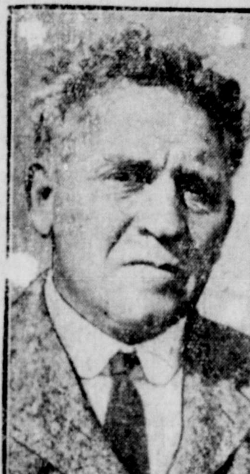
A. A. Stagg of Chicago University, has been given an M.A. degree for his services as director of athletics.