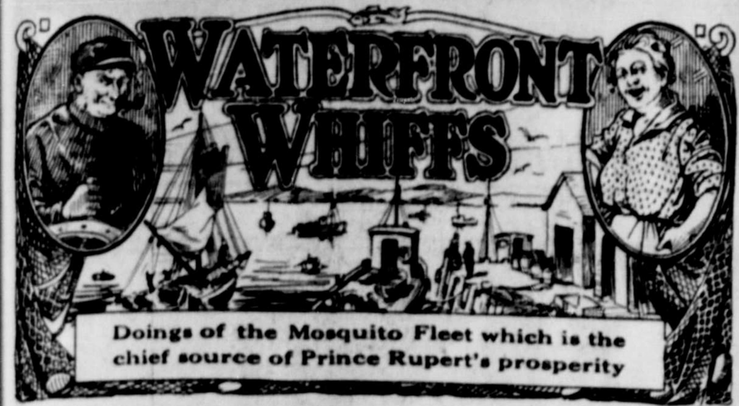
Doings of the Mosquito Fleet which is the chief source of Prince Rupert's prosperity