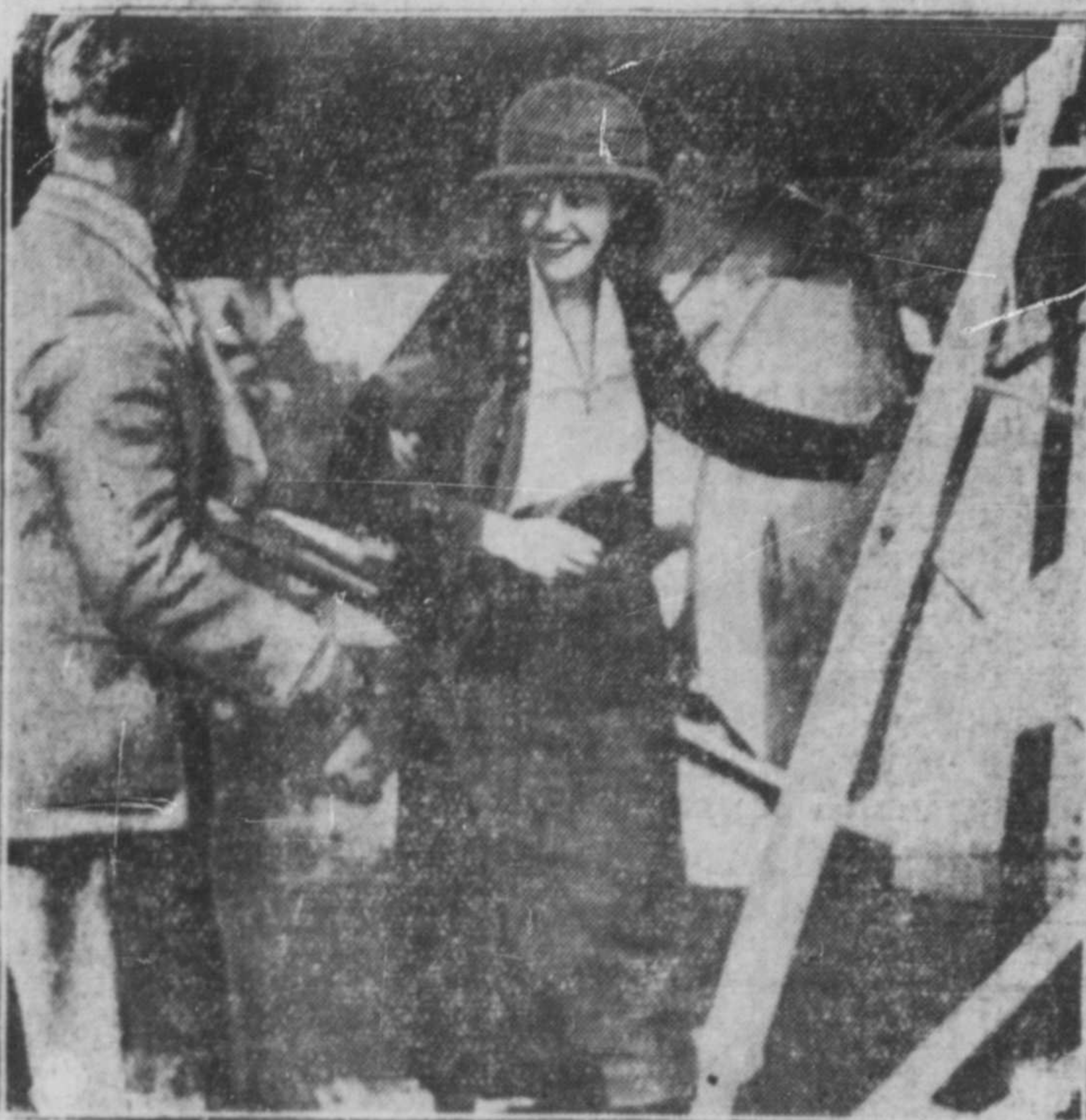
Here is Amy Johnson Mollison smiling triumphantly as she arrived at Capetown South Africa after her flight from London in four days, six hours and fifty-five minutes. The famous English girl flier broke the long-standing record of her husband, Capt. J. A. Mollison by ten and one-half hours. She has since flown back to England.