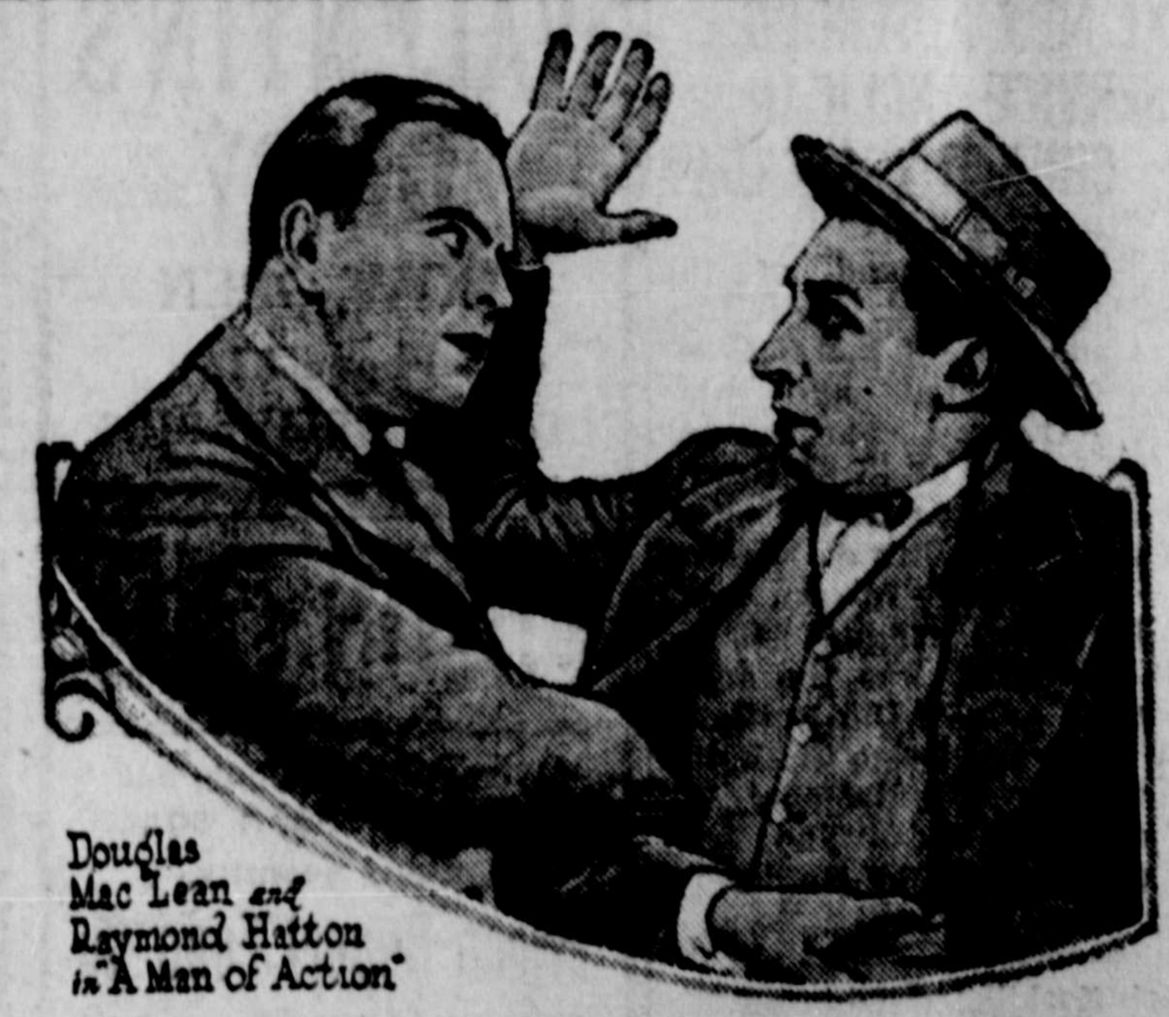
Douglas MacLean and Raymond Hatton in 'A Man of Action' Showing at the Westholme Theatre Wednesday and Thursday.

In "A Man of Action," a mystery comedy of unlimited thrills and laughter, which is to be seen here Wednesday, much of the