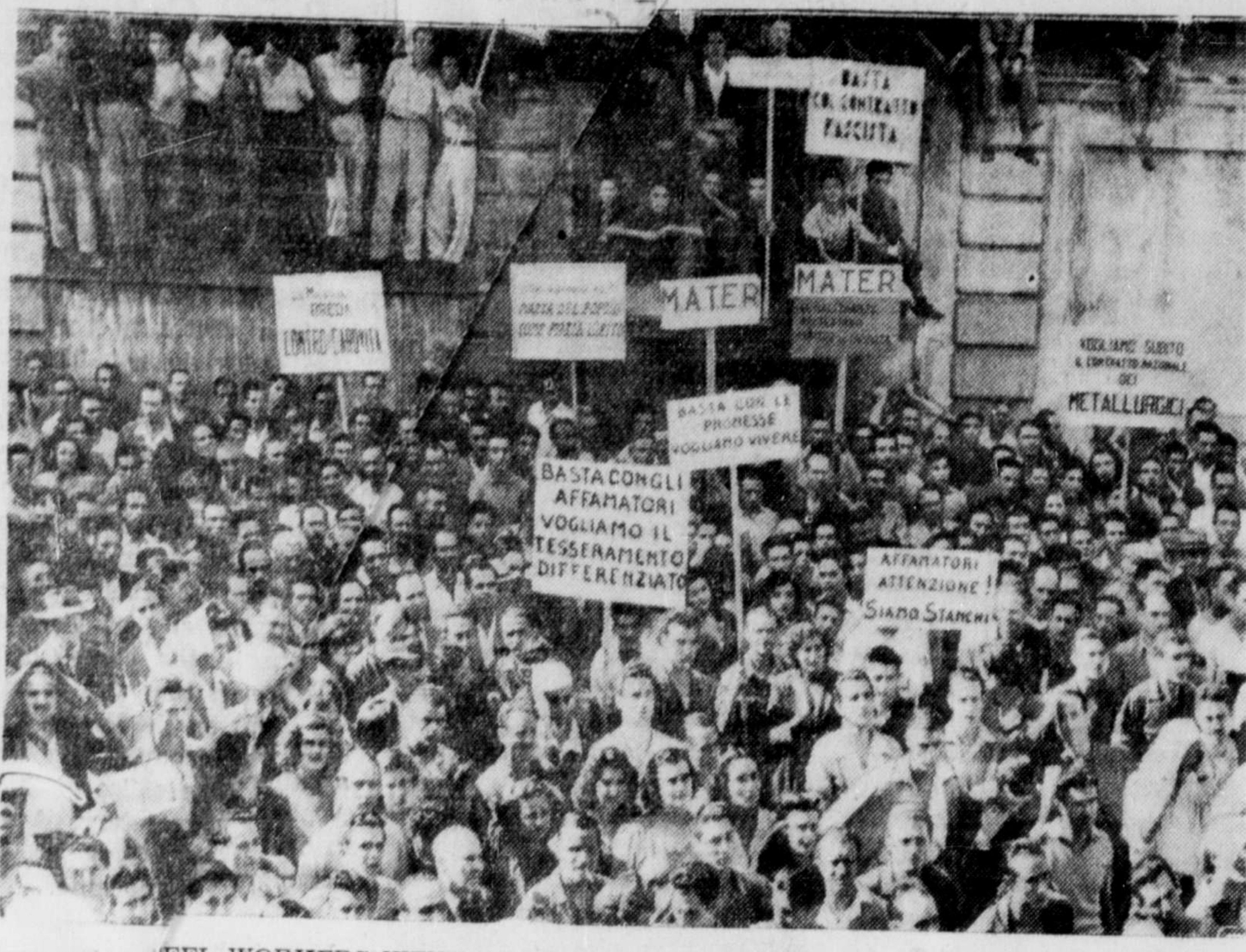
AS ROME STEEL WORKERS WENT ON 48-HOUR STRIKE—A general view of a mass meeting held by the Italian steel workers who went out on a nation-wide 48-hour strike recently, as part of an alleged Communist plan to overthrow the government of Premier Alcide de Gasperi.

SHARPSHOOTING SEDES STOCKHOLM —In the world championship shots held here, Sweden won six individual and six team victories. Norway and Switzerland took five gold medals, Argentina had three victories, Finland one and Italy one.