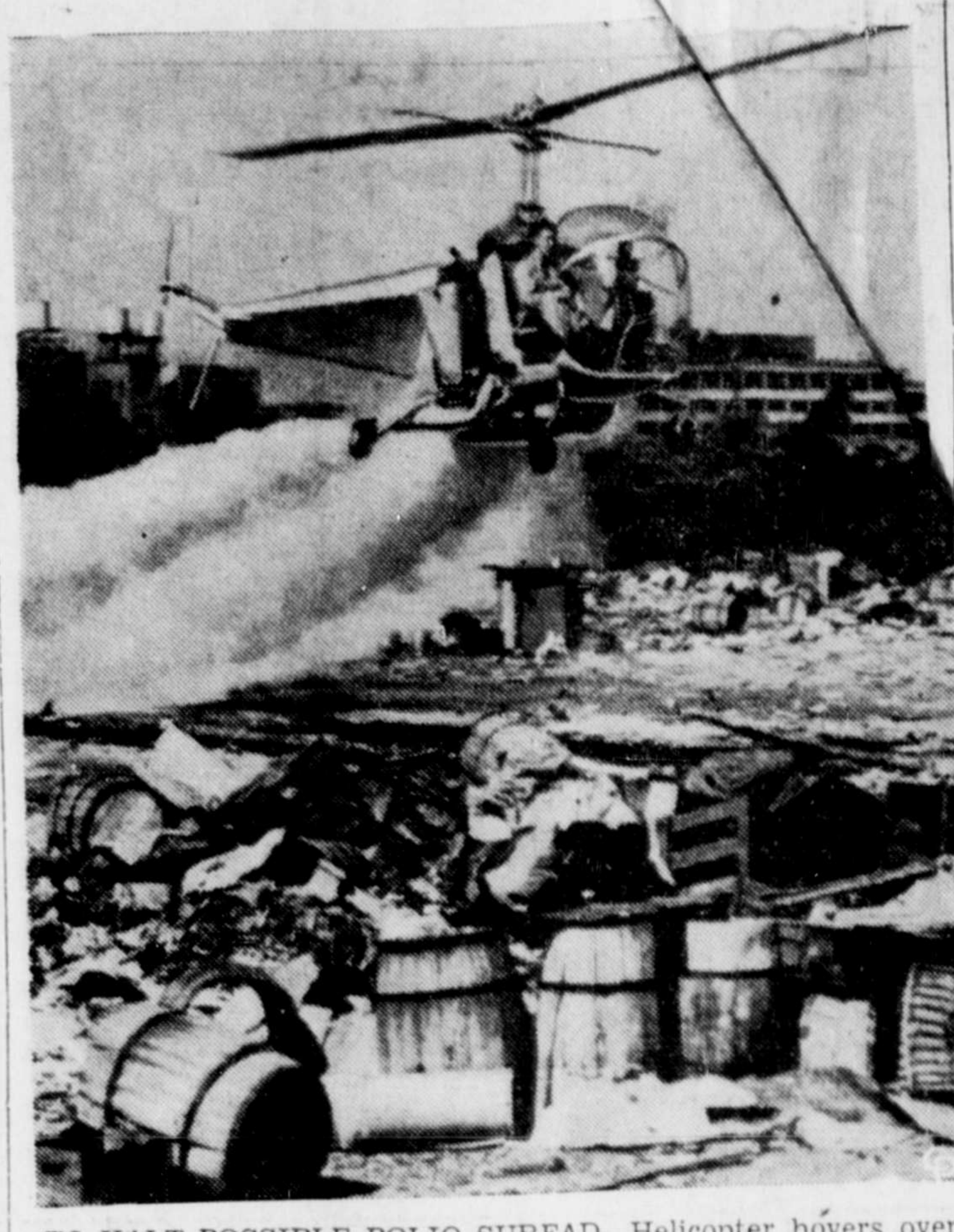
TO HALT POSSIBLE POLIO SPREAD—Helicopter hovers over the city dumps in Buffalo, N.Y., and sprays D.D.T. powder over the area. The Buffalo and Erie county chapter of the Infantile paralysis Foundation chartered the copter for the project to "eliminate the fly, believed to be the carrier of poliomyelitis." The total number of resident cases of polio in Erie County has risen to 22, compared with a total of eight last year.

Forecast Prince Rupert, Queen Charlottes and North Coast—Cloudy, frequently overcast. Showers today and Friday. Winds southerly (20 m.p.h.). Little change in temperature. Lows tonight and highs Friday—At Port Hardy 45 and 56, Masset 43 and 58, Prince Rupert 41 and 61.