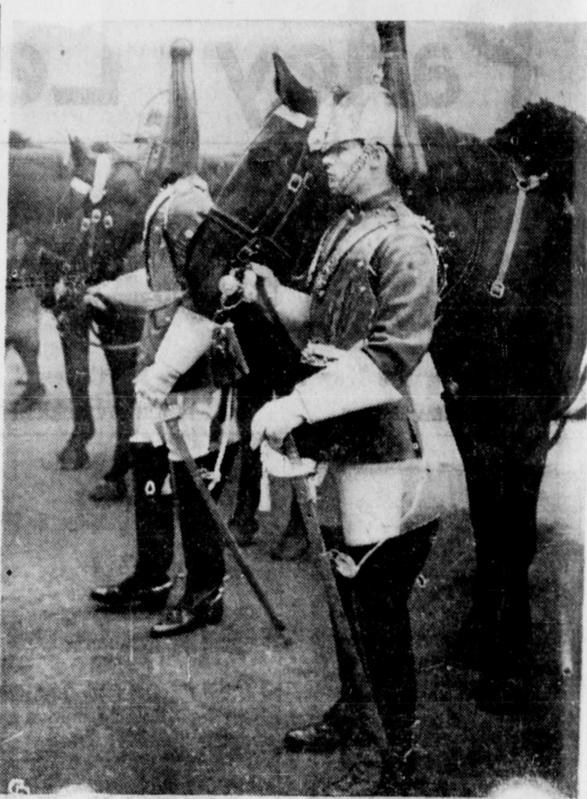
FULL DRESS UNIFORMS FOR ROYAL ESCORT—The Royal Household Cavalry escort for the royal wedding procession wore full dress uniforms. Previous plans had called for the royal escort to appear in khaki...

As time goes on, the painless process of autonomy within the Empire continues.