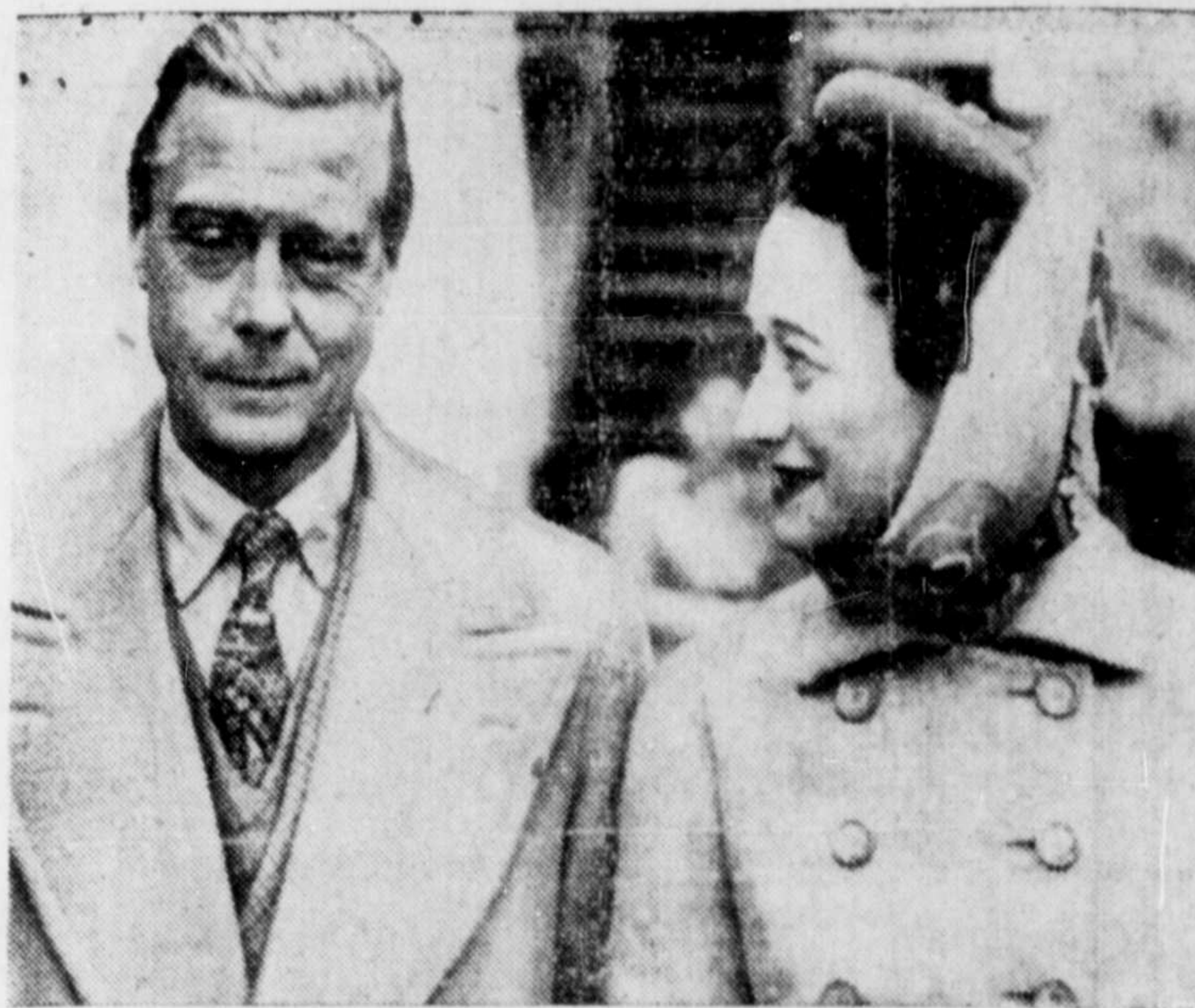
WINDSORS MAY VISIT ALBERTA RANCH — The Duke and Duchess of Windsor, shown aboard the liner Queen Mary, told reporters on their arrival in New York after a six months trip to Britain and France that they may visit the Duke's E. P. Ranch south of Calgary, Alta. The Duke termed his ranch a "great link with Canada" and it is a piece of property which "is an assurance I shall return there some day." The Windsors, who were omitted from the invitation list for the wedding of Princess Elizabeth and Lieut. Philip Mountbatten on November 20, declined to discuss the royal wedding, terming it "purely a personal and family matter."

TIMBER SALE X42793 Scaled Tenders will be received by the Minister of Forests at Victoria, B.C., not later than 11 a.m. on the 29th day of December, 1947, for the purchase of licence X42793, to cut 3,775,000 L.B.M. of spruce, cedar, and hemlock, on an area situated on Mosquito Lake, Cumsheewa Inlet, Queen Charlotte Islands Land District.