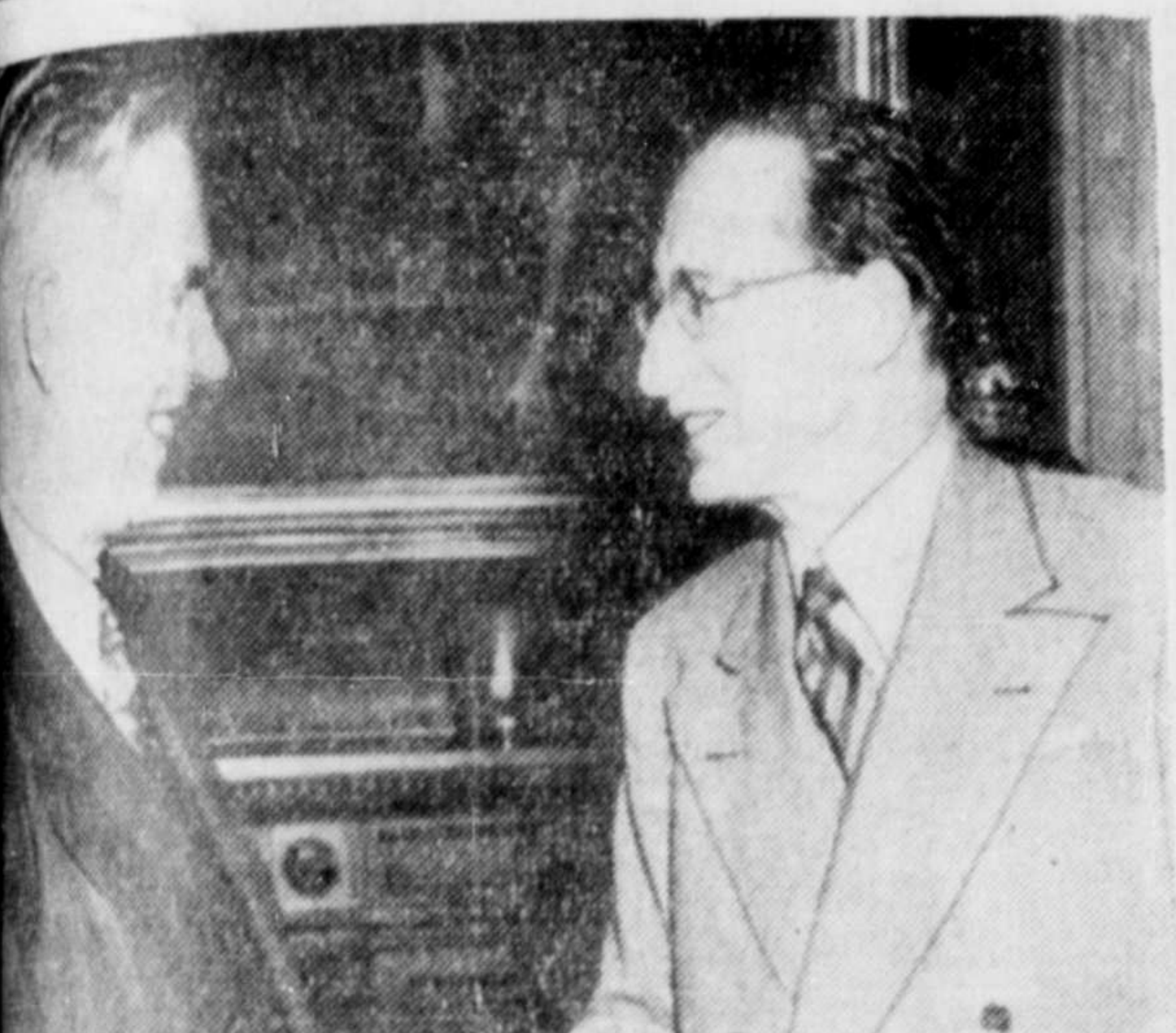
COMPLETES FACT-FINDING TOUR—Henry Wallace is shown as he was greeted by Premier Alcide de Gasperi when he arrived in Rome from Palestine. Wallace completed a private fact-finding tour of Palestine and is returning to the United States.