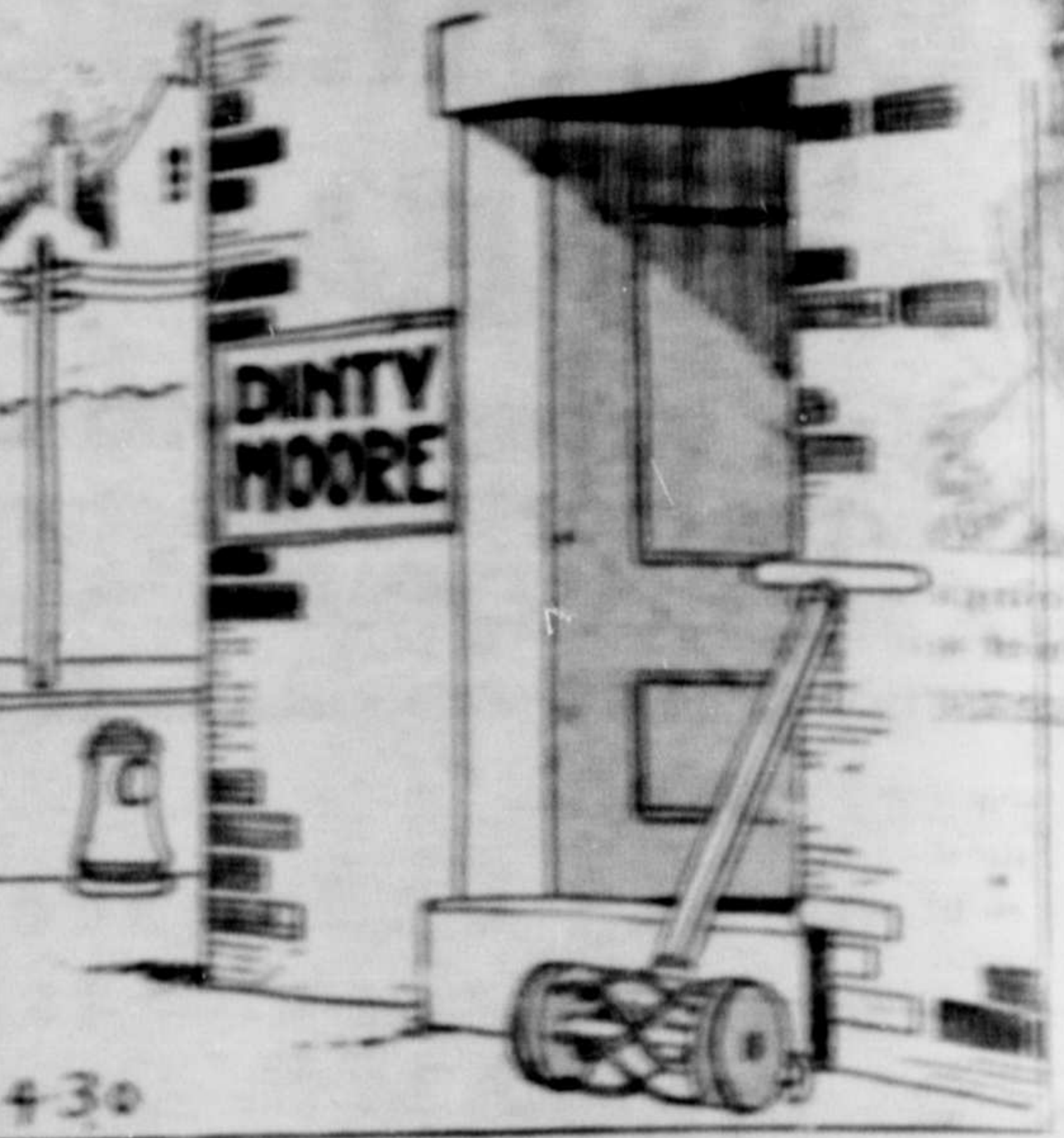
© 1936 by Jerry, Feature Service, Inc.