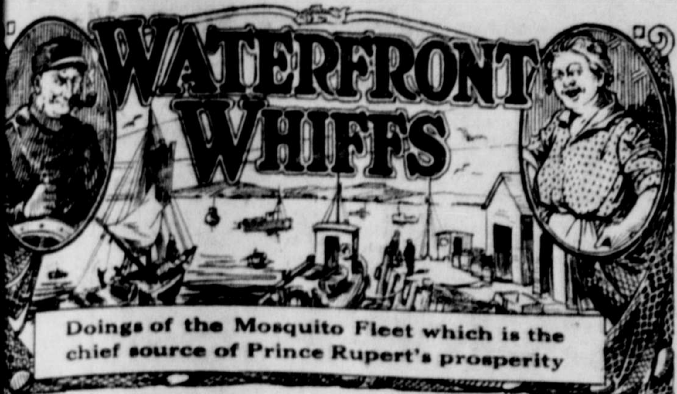
Doings of the Mosquito Fleet which is the chief source of Prince Rupert's prosperity

The deep sea banks were hit by a strong gale during last week ending to skippers of the big boats which came into port on Monday morning and fishing has given somewhat of a setback to the industry. The twenty boats arriving on Monday with 330,000 lbs. of halibut had made their previous to the storm coming up. Doubtless the gale has not done with the light boats during the week. On Monday the arrivals dropped 2,000 pounds when the price of Canadian fish jumped from 12c to 12.2c and Canadian fish 8.5c to 10.2c for first class while second class fared up a cent. On Wednesday and Thursday a total of 36,000 pounds of halibut was landed by Canadian schooners when class fish sold around 11c and second around 7c. Yesterday American and two Canadian schooners brought in 82,000 pounds of halibut and two trollers landed 1,100 lbs. of salmon and 200 pounds of fish.