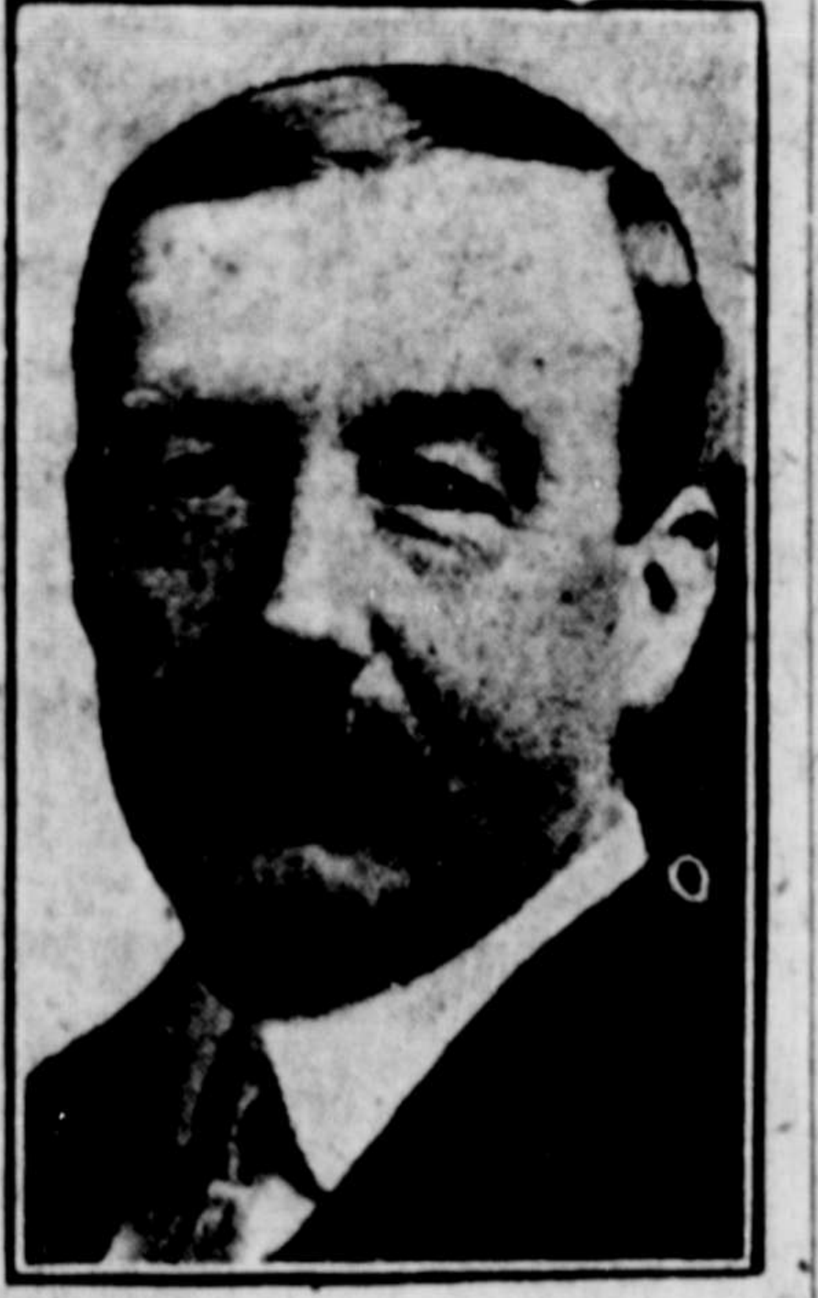
Right. Hon. Arthur Henderson, who was elected member for Burnley.