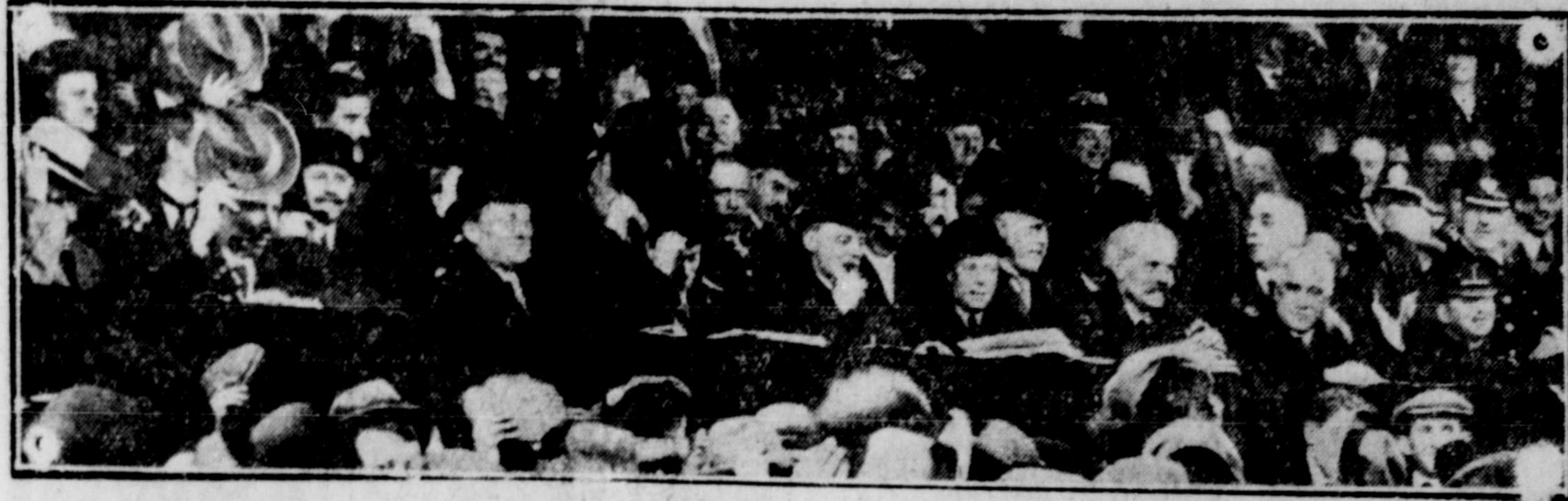
An enthusiastic crowd greeted the Prince of Wales and the Duke of York when they entered the Cardiff Arms Park to watch the Ireland vs. Wales rugby match. Photograph shows Mr. Ramsay Macdonald, the Prince of Wales and the Duke of York in the grandstand.