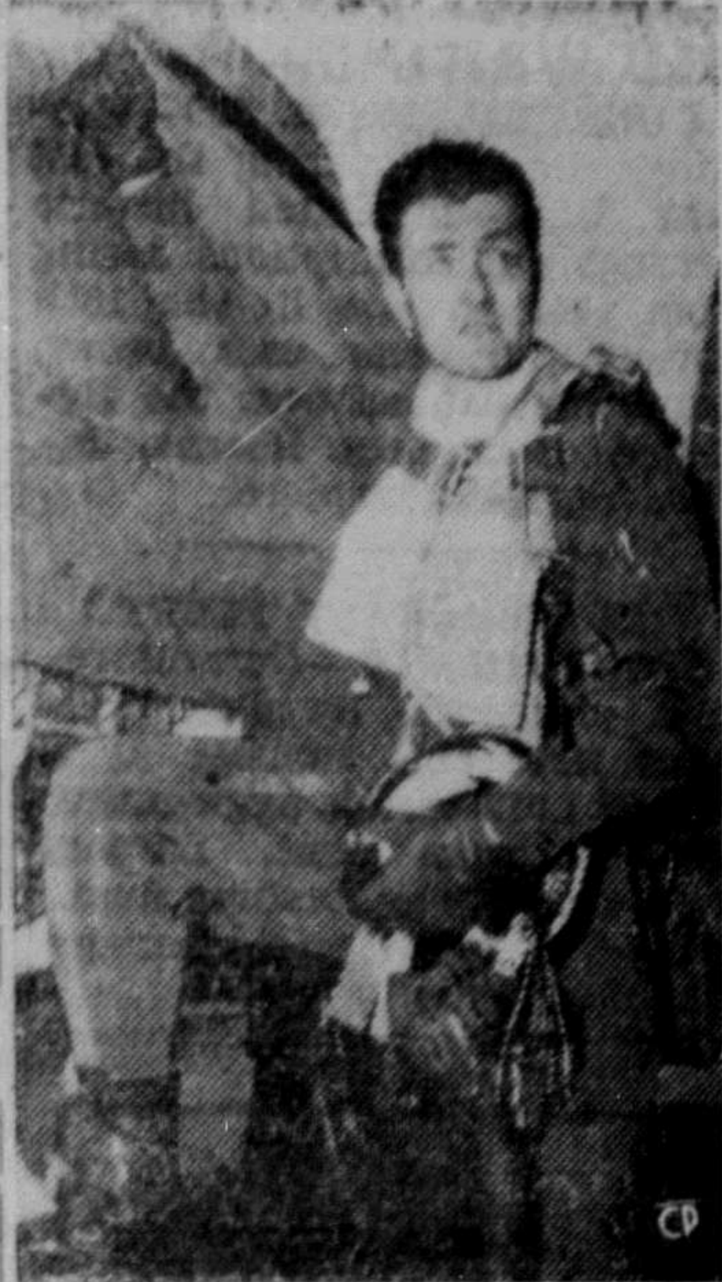
BLASTS RED JETS —Flying Officer Bruce S. Fleming of Montreal has a record of two MIG-15 enemy jets probably destroyed in the Korean war. An RCAF pilot on exchange duty with the Fourth Fighter Interceptor Wing of the United States Air Force, he has had more than 35 missions in F-86 Sabre jets in 1951.

The information is disclosed in a memorandum on supplementary estimates of £35,456,000 Parliament will be asked to approve covering additional payments to medical practitioners under a recent award. For 1952 alone the award calls for distribution of an extra £10,743,000.