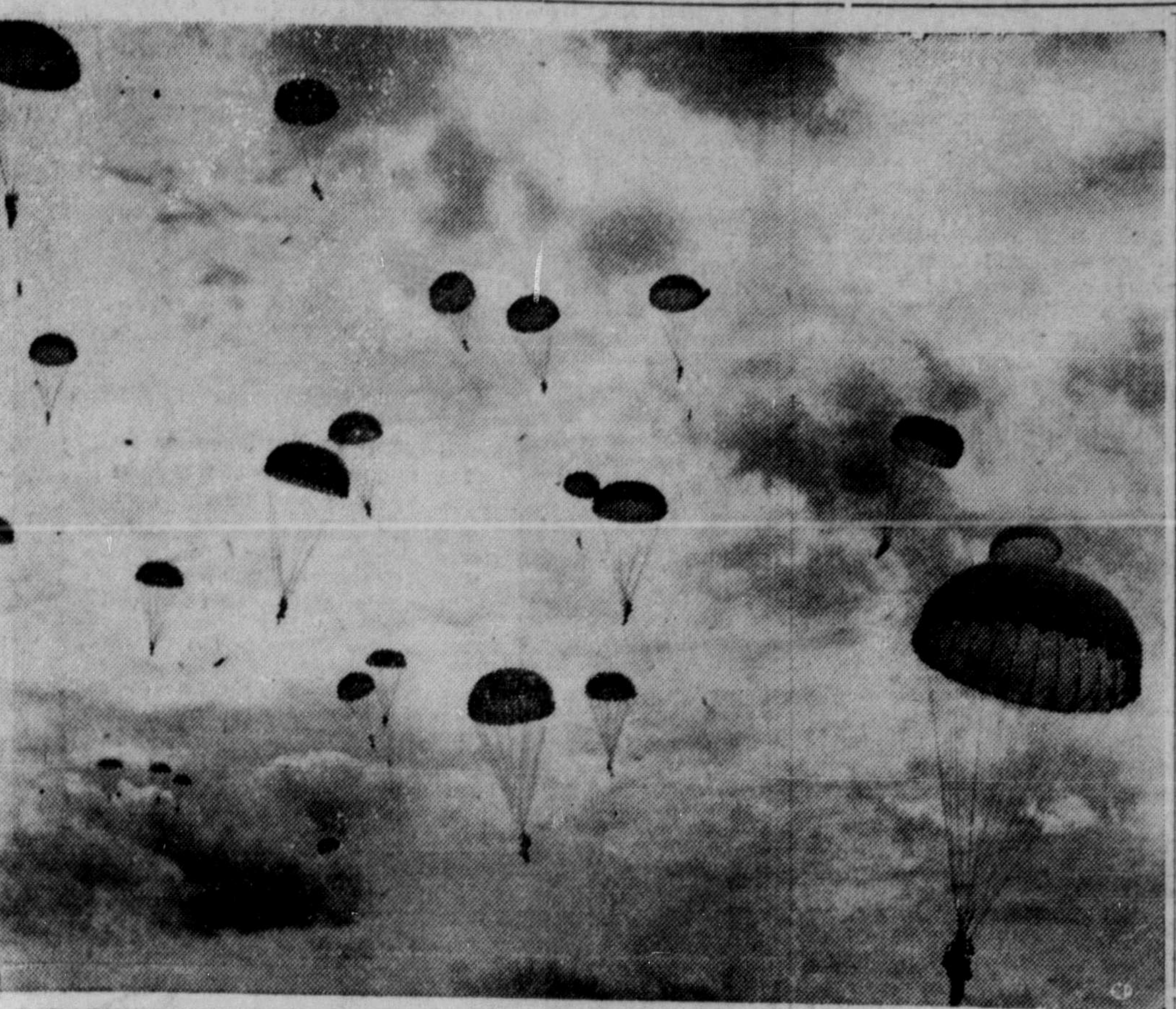
PARACHUTE PATTERN —About 20 paratroopers of the Royal Canadian Regiment's Second Battalion form a picturesque pattern as they descend to the St. Thomas, Ont., Municipal Airport. The air exercises were part of the Elgin County centennial celebrations. The paratroopers took the airstrip in a mock battle from the defending Elgin Regiment.