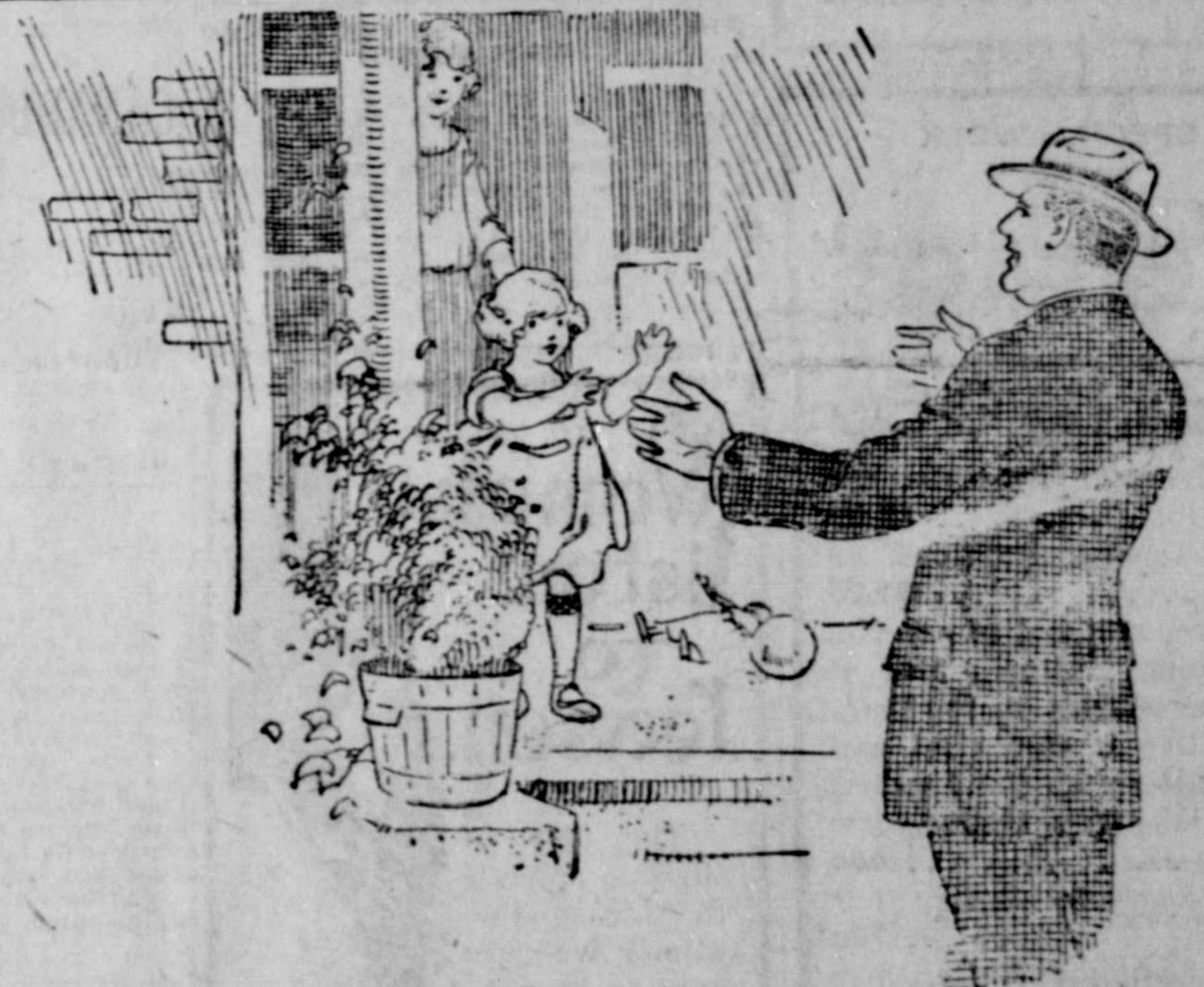
The Love that never Dies