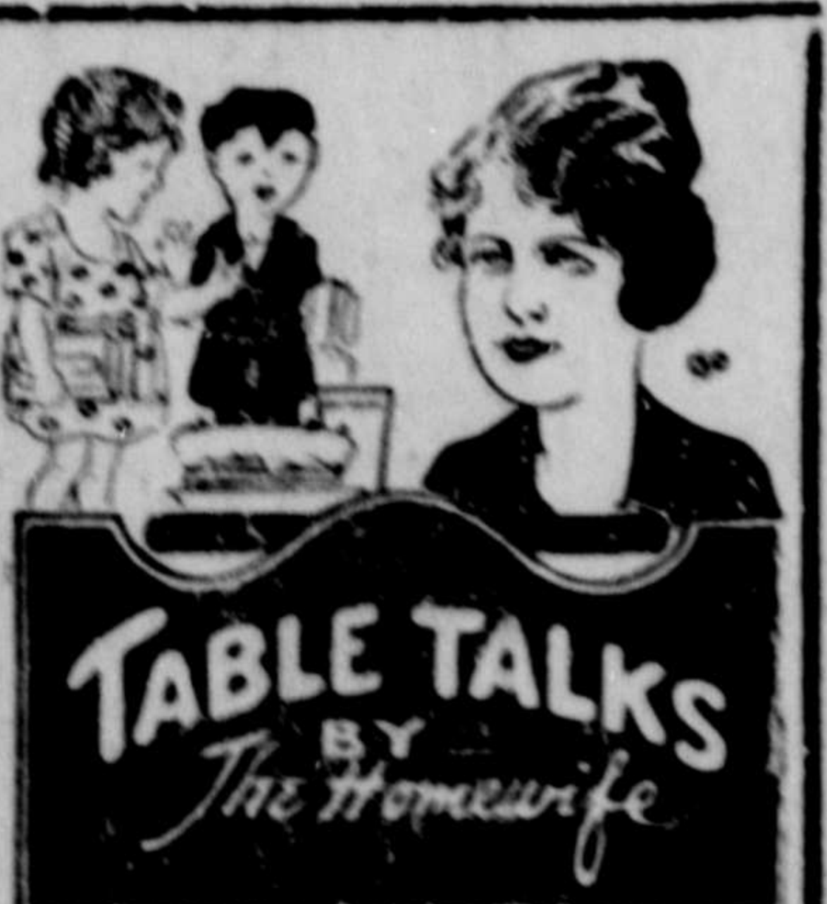
TABLE TALKS BY The Housewife NO. 1 ALBERTA POTATOES 12 lbs. for . . . . . 25c Per sack . . . . . $1.50 Special prices for quantity lots. Rupert Table Supply Three Phones 210, 211, 212.

Owen Moore, Sidney Chaplin, Tully Marshall, Charles Gerrard, Sylvia Breamer and specially selected cast. COMEDY CARTOON—“FELIX TRIES FOR TREASURE.” FOX NEWS-GAZETTE. Admission 35c and 10c.