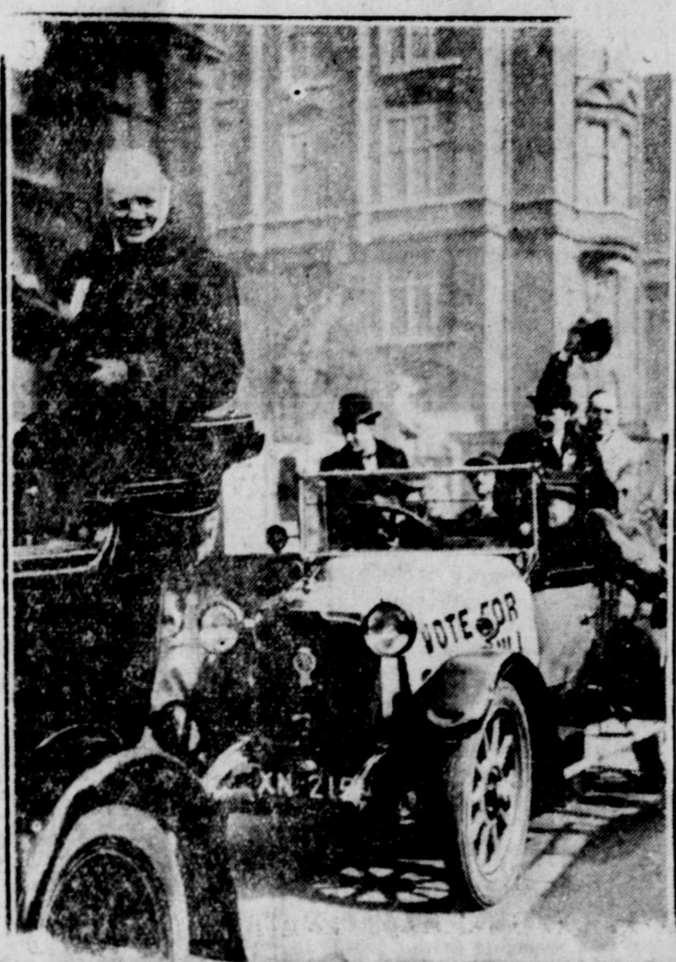
Photograph shows how Mr. Winston Churchill toured the polling stations on the day of the recent Westminster by-election when he was defeated by a small majority.