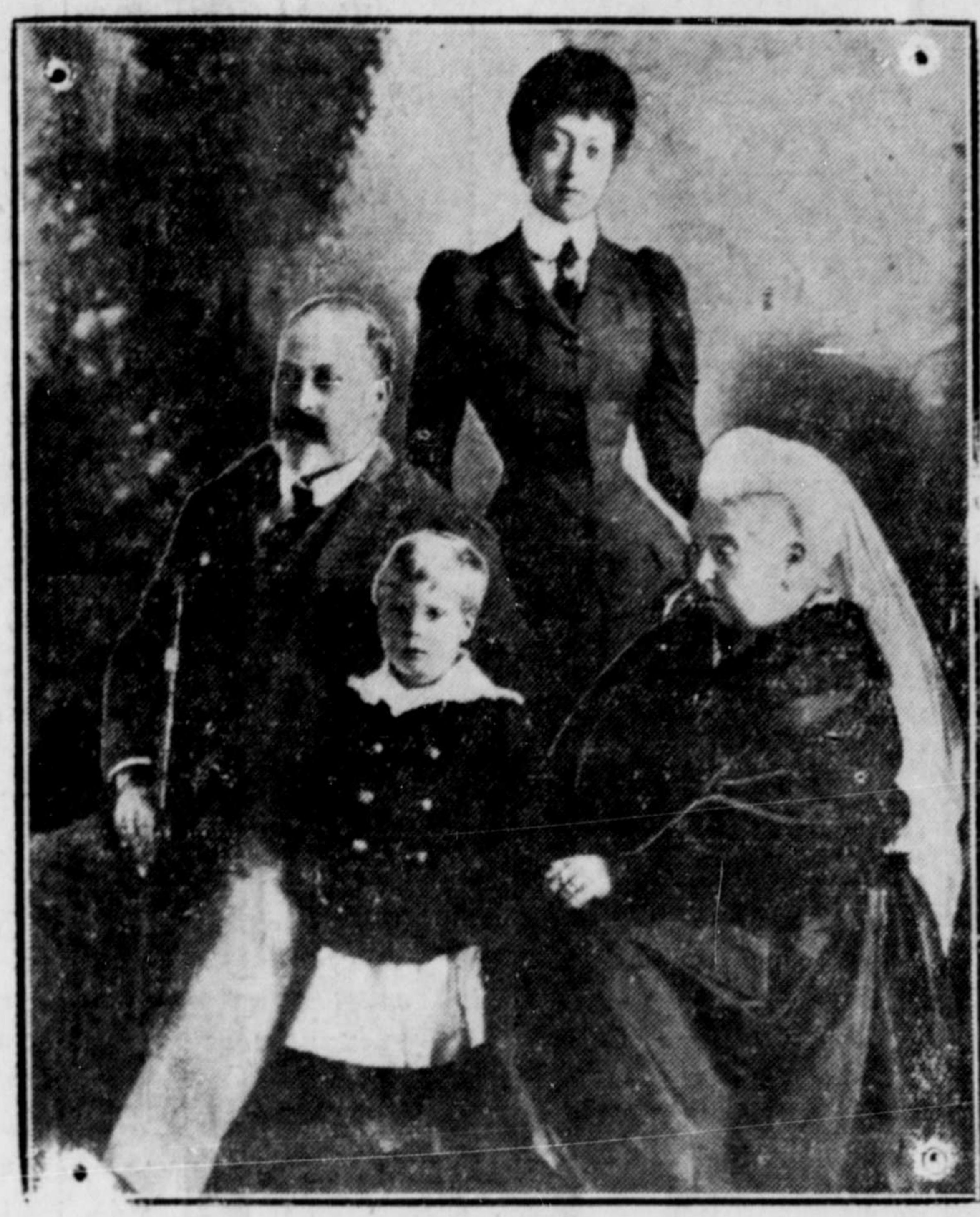
The Prince of Wales is here seen in front, as a little boy, with the late King Edward VII. and Queen Alexandra, grandfather and grandmother, and the late Queen Victoria, great grandmother.