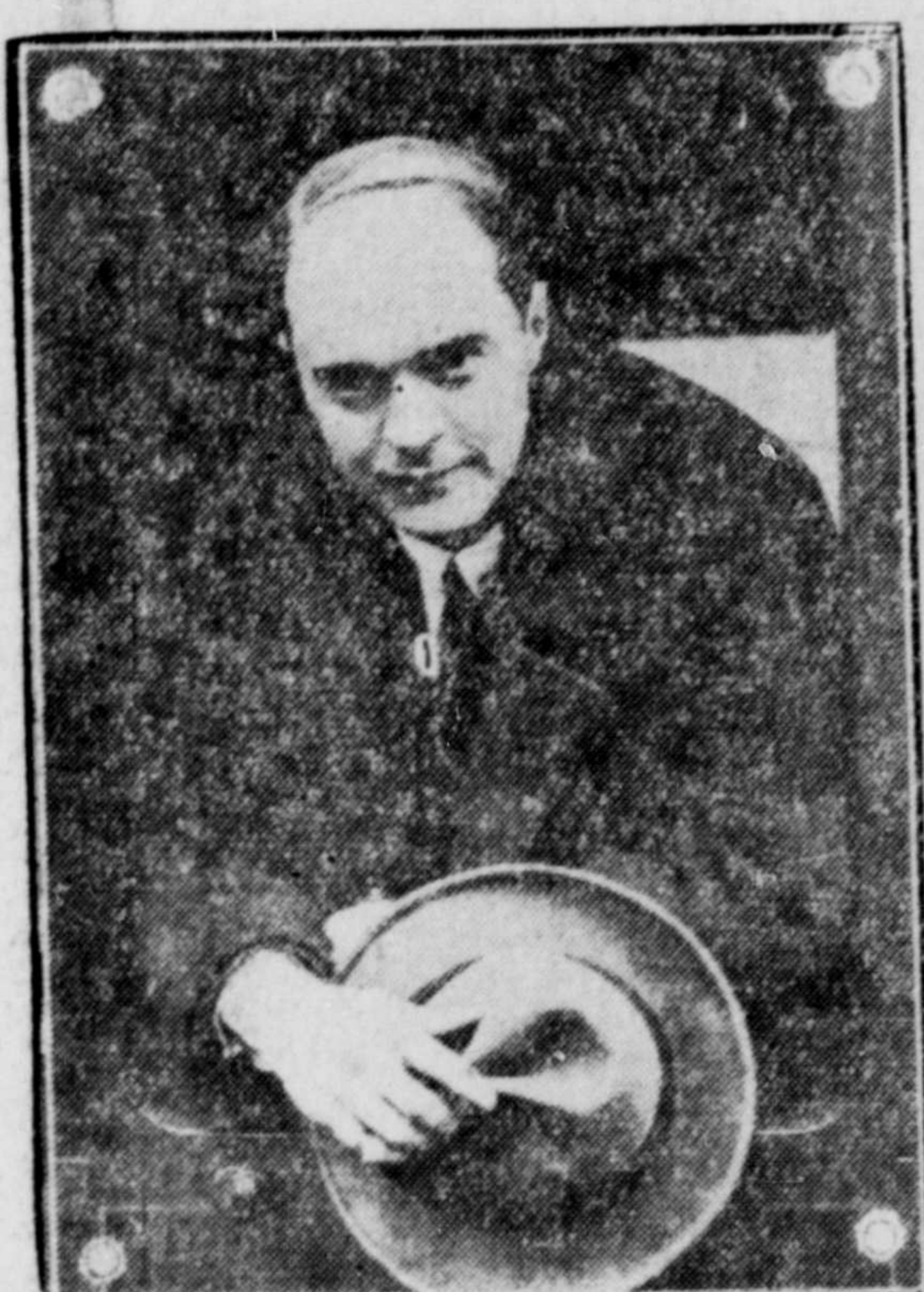
Capt. Bruce Bainsfather, the originator of "Old Bill," says good-bye to London again from Waterloo station, previous to sailing for America.

OTTAWA, Dec. 27.—The department of national defence and naval service announces the appointment as paymaster sub-lieutenant in the Royal Canadian Naval Reserve of Capt. E. McGoskrie, Prince Rupert.