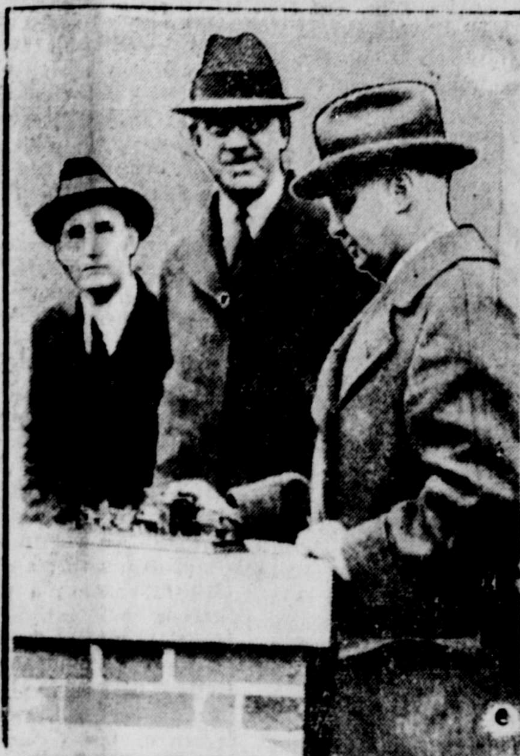
Here is the way the news of the illness and death of ex-President Wilson was transmitted to the world. A reporter is shown dictating bulletins to a special telegraph operator who had a direct wire in operation on the steeple of the Wilson Home.