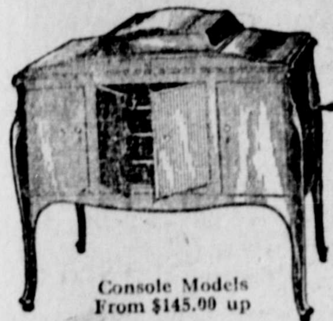
Console Models From $145.00 up

A Genuine Victor Victrola No. 210, with 10 double-sided records (20 selections), 200 Best British steel needles, one record brush, one record album.