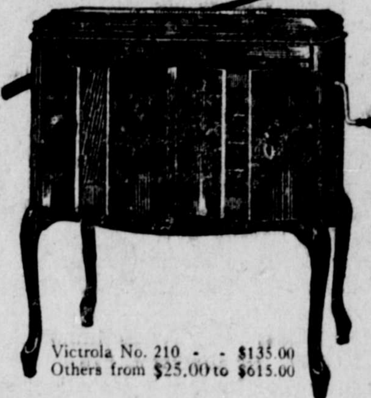
Victrola No. 210 - $135.00 Others from $25.00 to $615.00