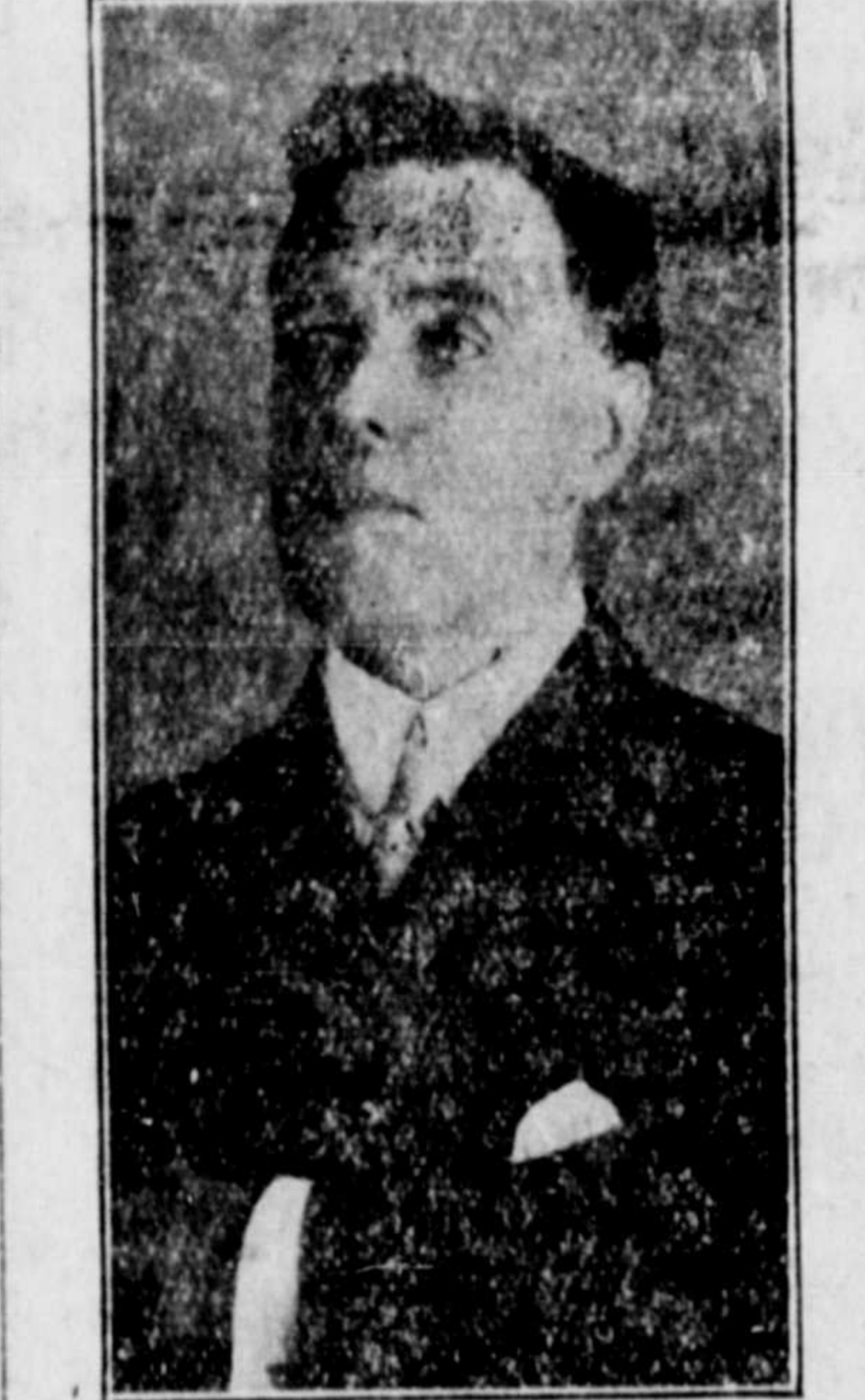
Chosen by People of Prince Rupert for Sixth Term