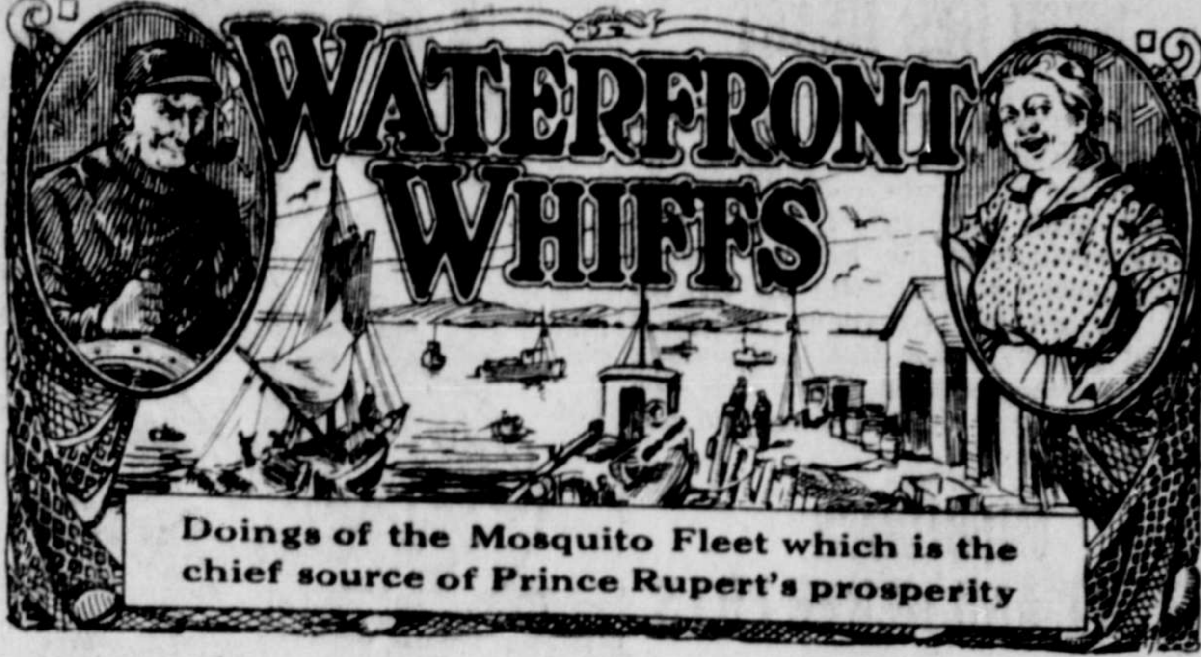
Doings of the Mosquito Fleet which is the chief source of Prince Rupert's prosperity

Prince Rupert's Leading Restaurant. A Bakery Unsurpassed Third Avenue.