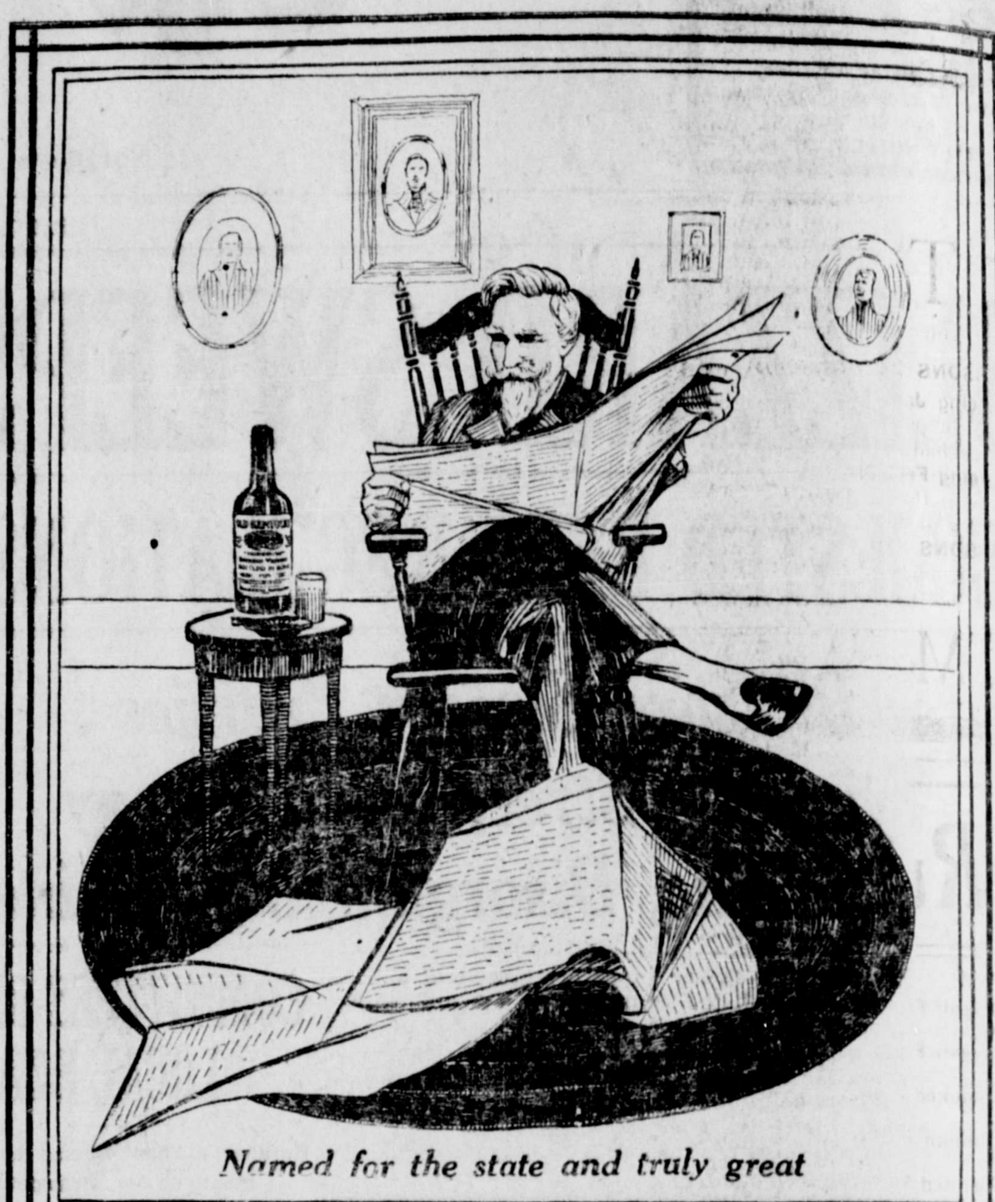
Named for the state and truly great