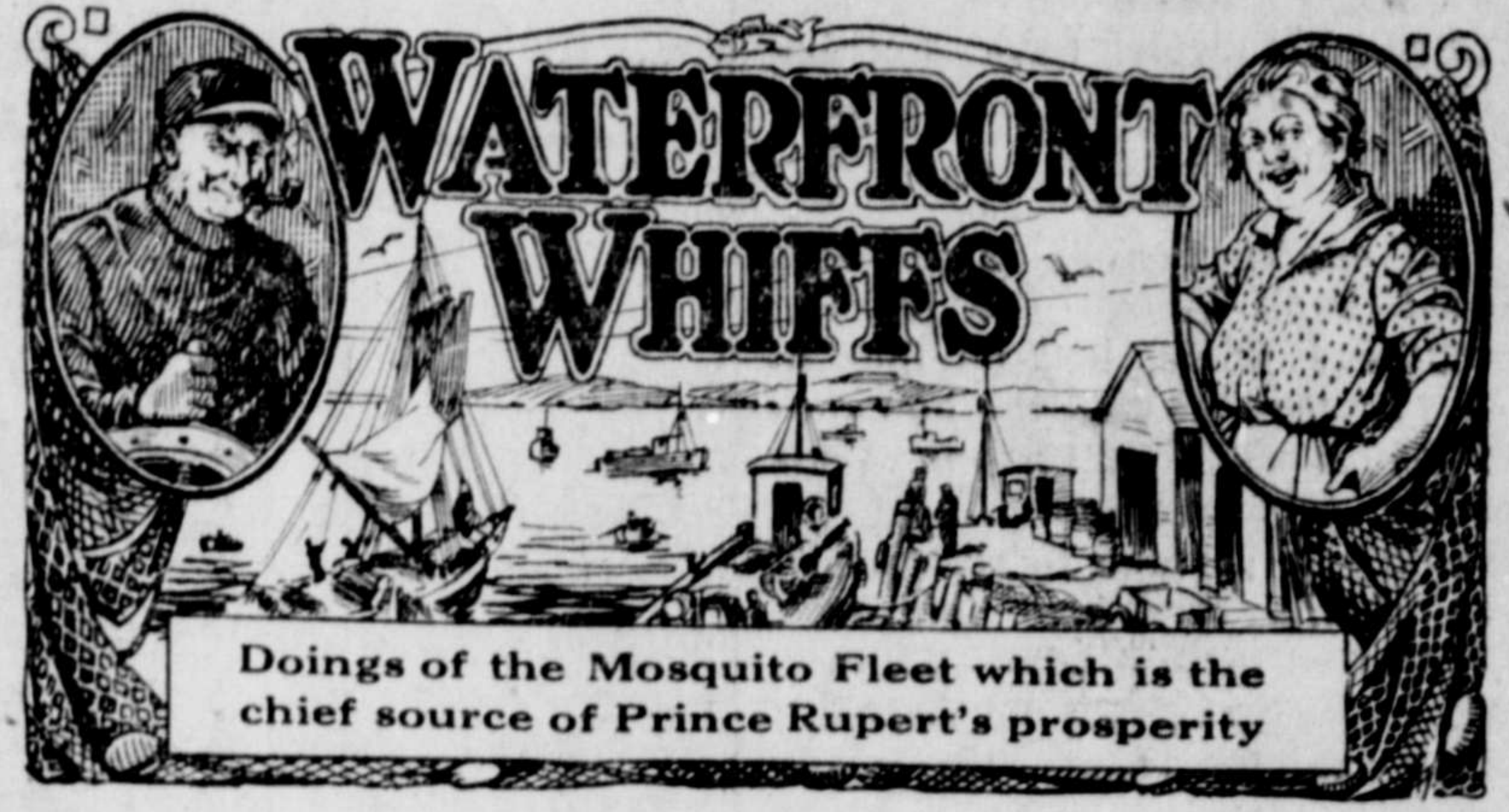
Doings of the Mosquito Fleet which is the chief source of Prince Rupert's prosperity

The volume of halibut landed during the week has been well up to the average and prices offered on the Fish Exchange for both American and Canadian fares have kept up, although on Thursday the prices dropped approximately 5c and 2c on American and Canadian fish due in a measure, to the fact that arrivals had been heavy for the week and the eastern market was pretty well filled up. Incoming skippers report the weather on the deep sea grounds to have been "breezing up" for the last few days although good weather was experienced over last week and the fishing was consistently good, taking all things into consideration.