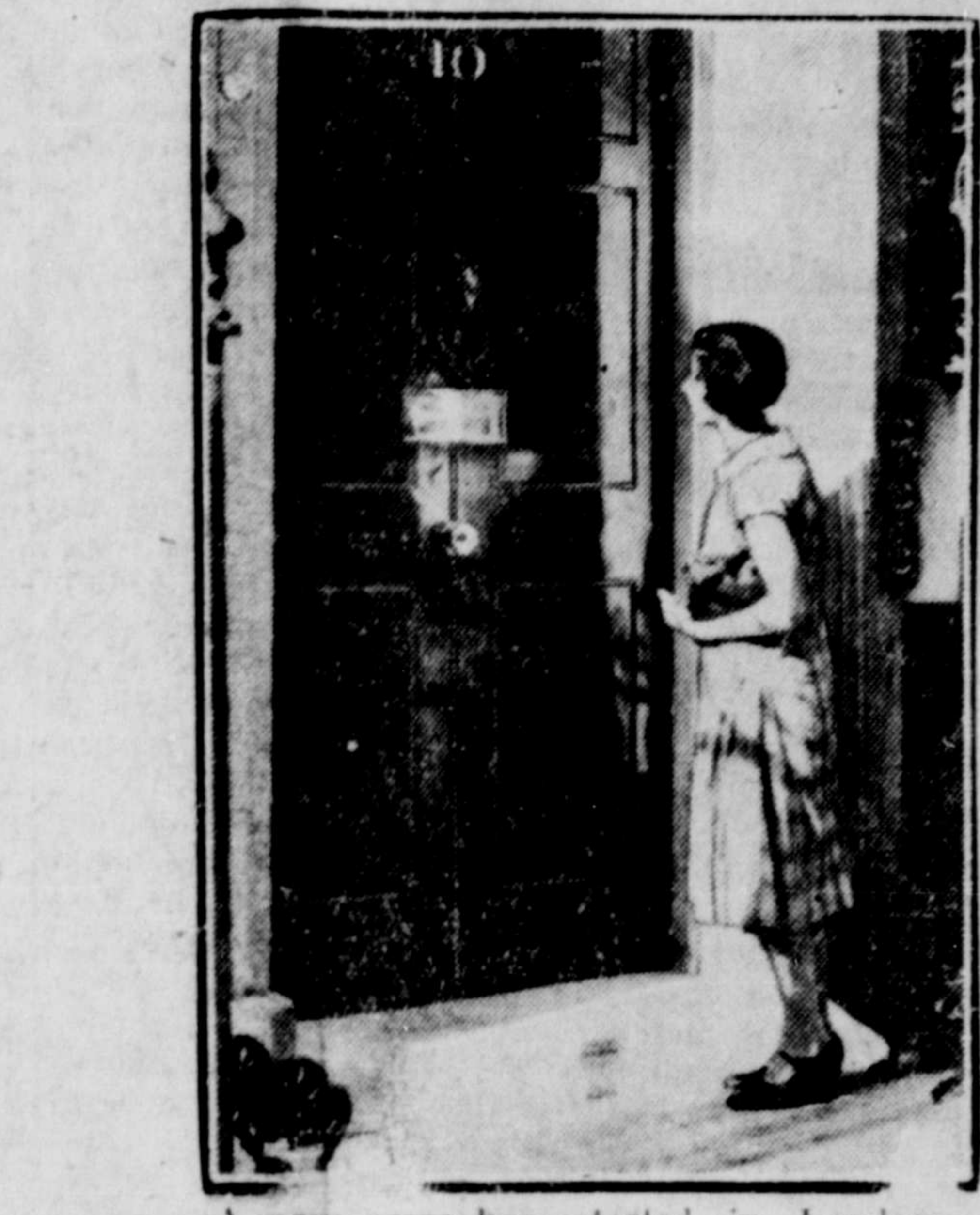
A new craze has started in London—kissing the knocker on the door of 10 Downing Street, official residence of the prime minister.