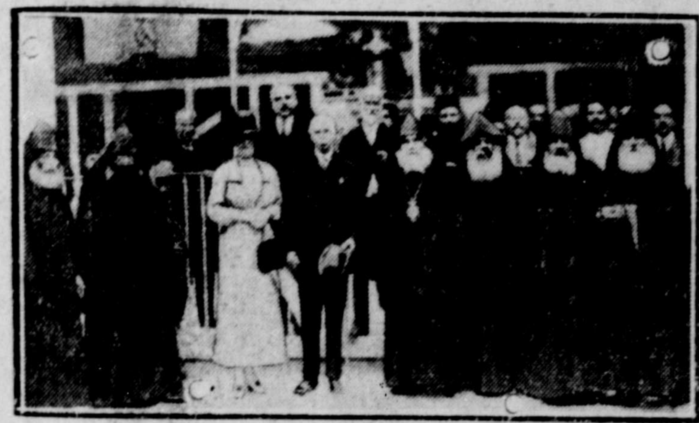
Lord Plumer, new high commissioner for Palestine, shown with Lady Plumer, visiting the Armenian church in Jerusalem

PORTLAND, Dec. 17.—Victoria again came off second best in the hockey game last night, Portland winning by two goals to one.