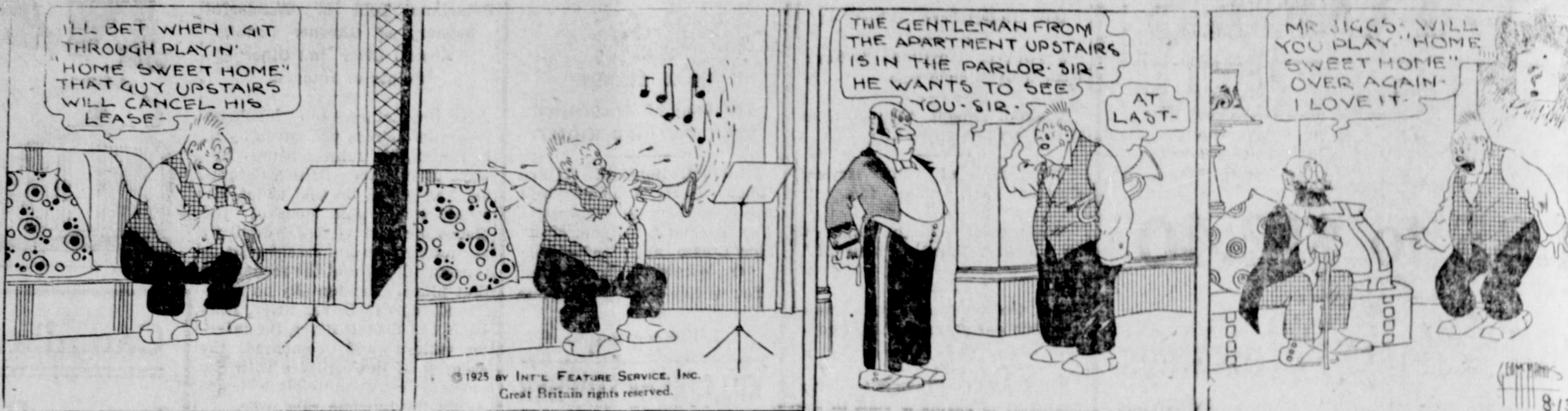
© 1925 BY INT'L FEATURE SERVICE, INC. Great Britain rights reserved.