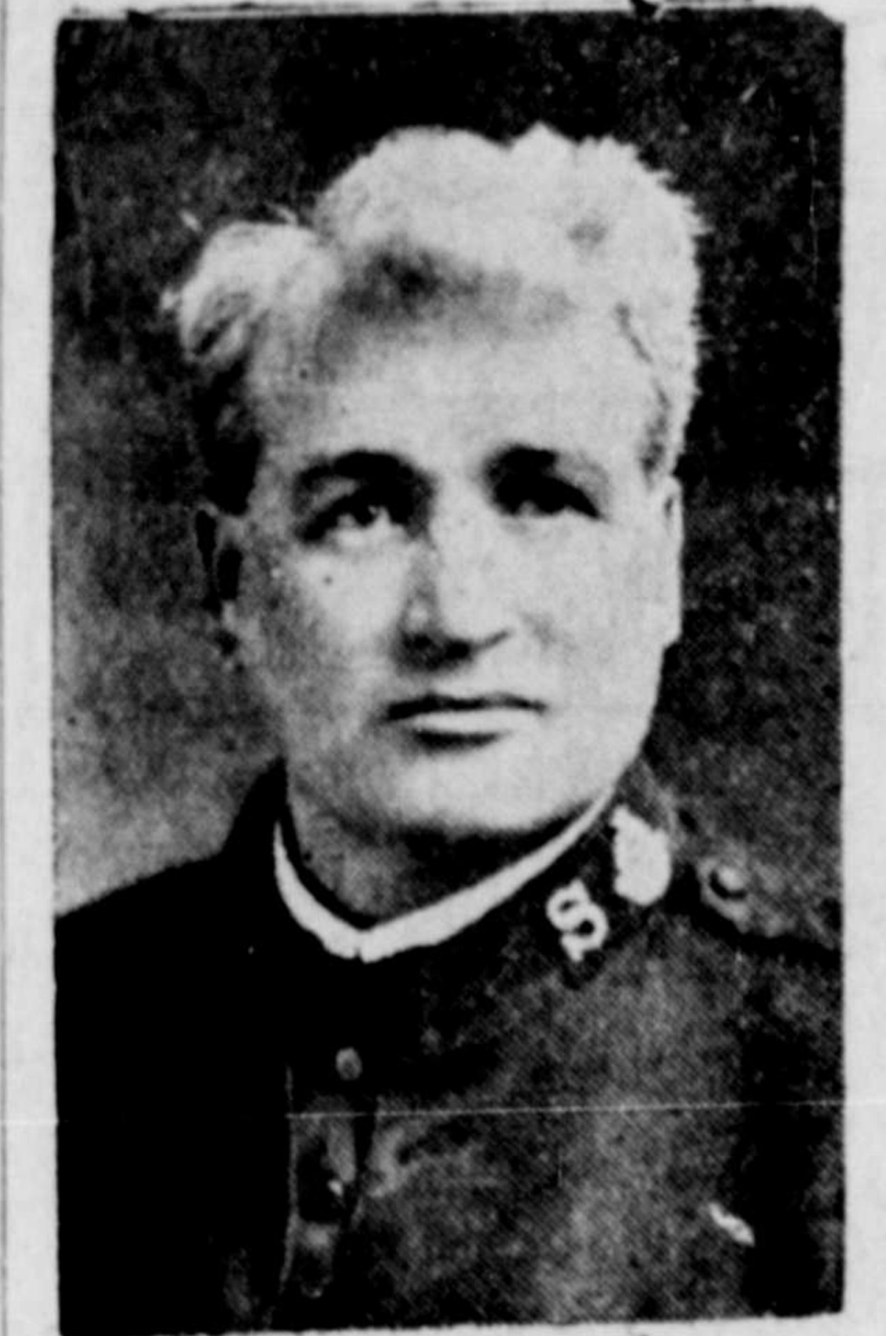
Salvation Army Officer who is conducting revival in City this week.