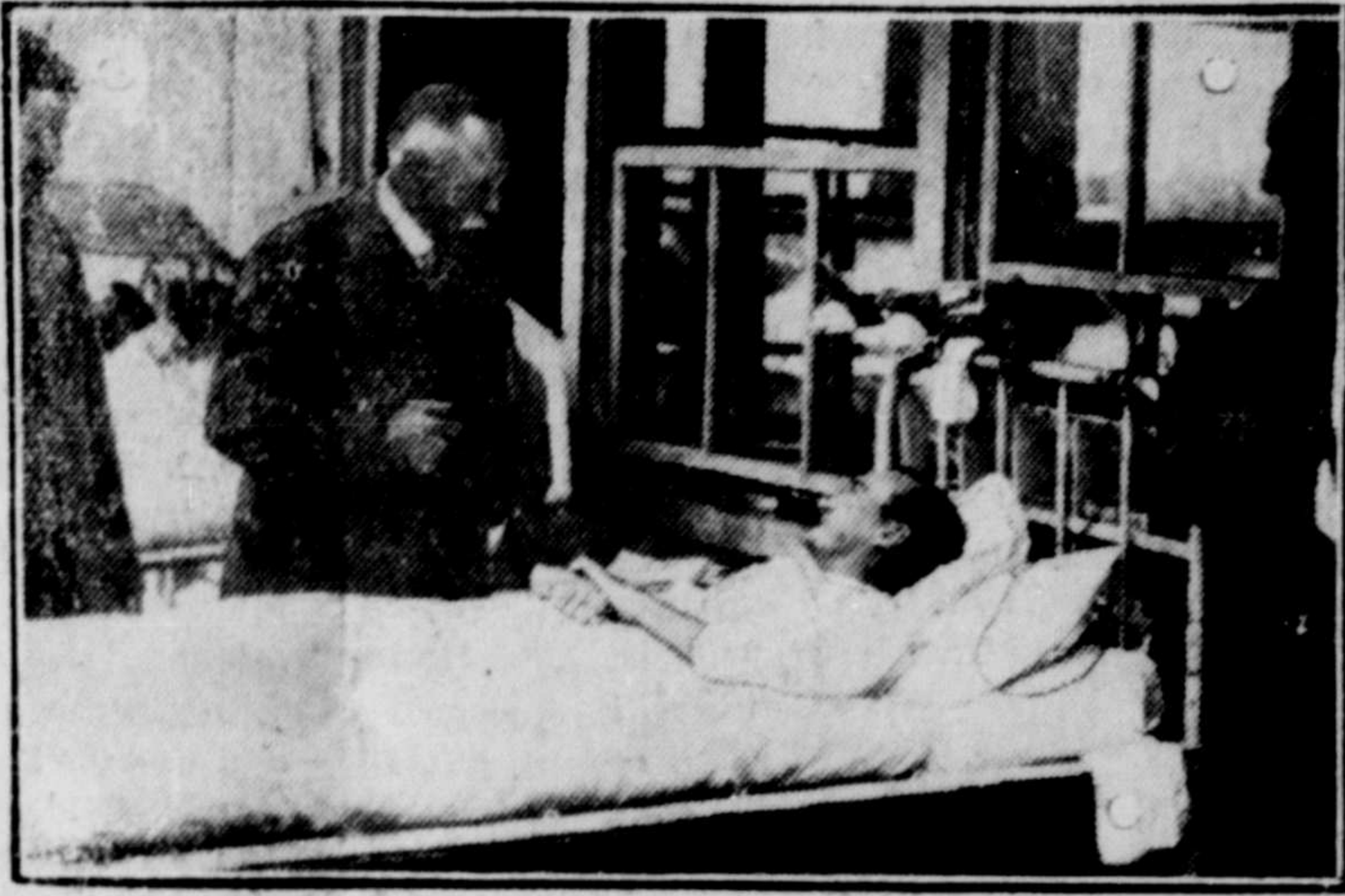
Earl Haig is shown chatting with one of the patients at Christie Street Hospital, who fought under the famous field marshal during the Great War

The fire brigade was called but the fire was practically out before it arrived.