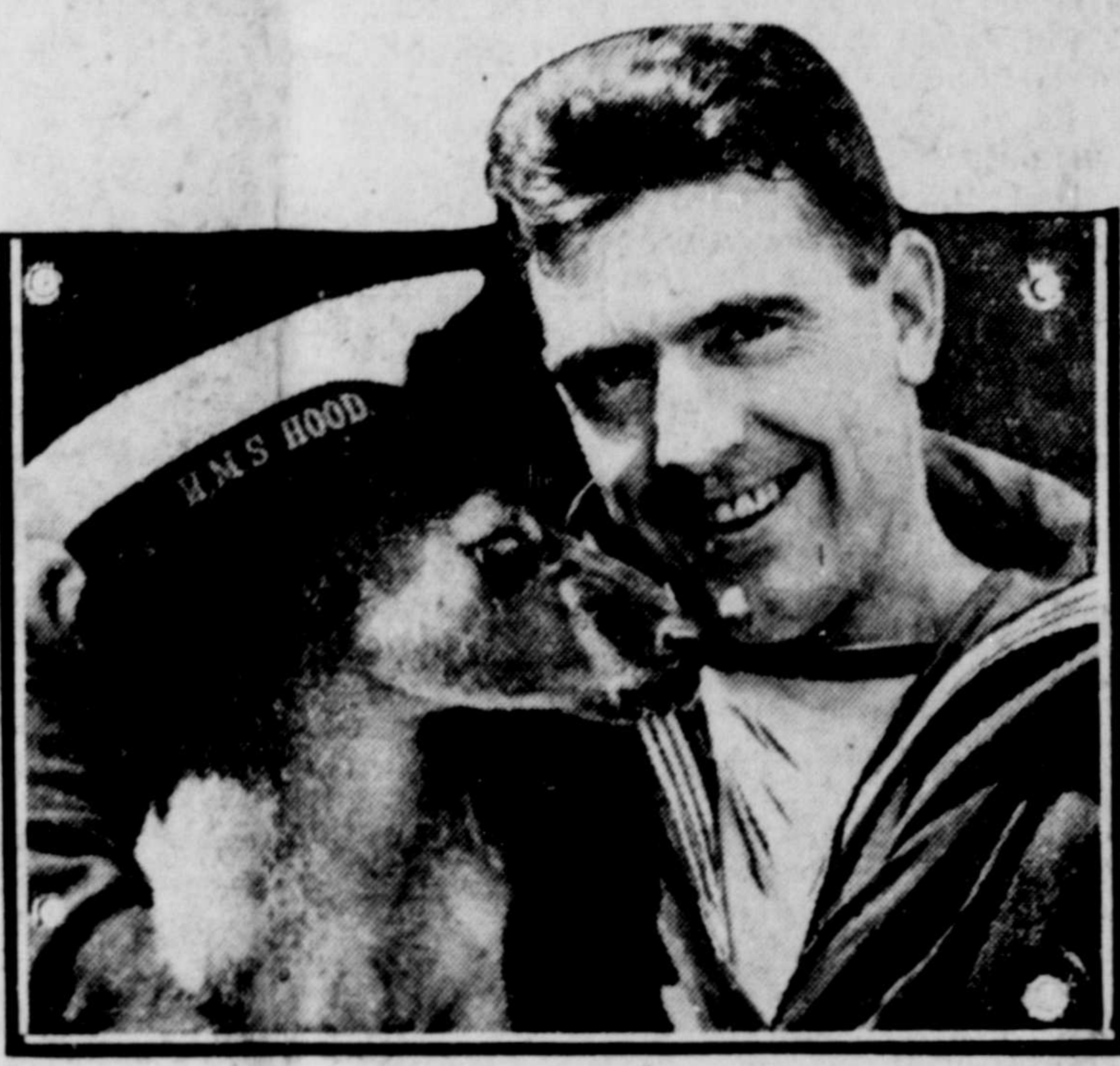
A British tar on friendly terms with the blind Kangaroo mascot at the sailing regatta of the Atlantic fleet