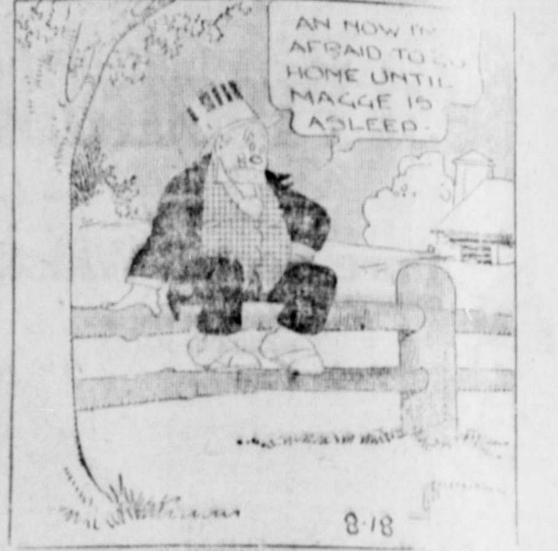
© 1925 BY INT'L FEATURE SERVICE, INC. Great Britain rights reserved.