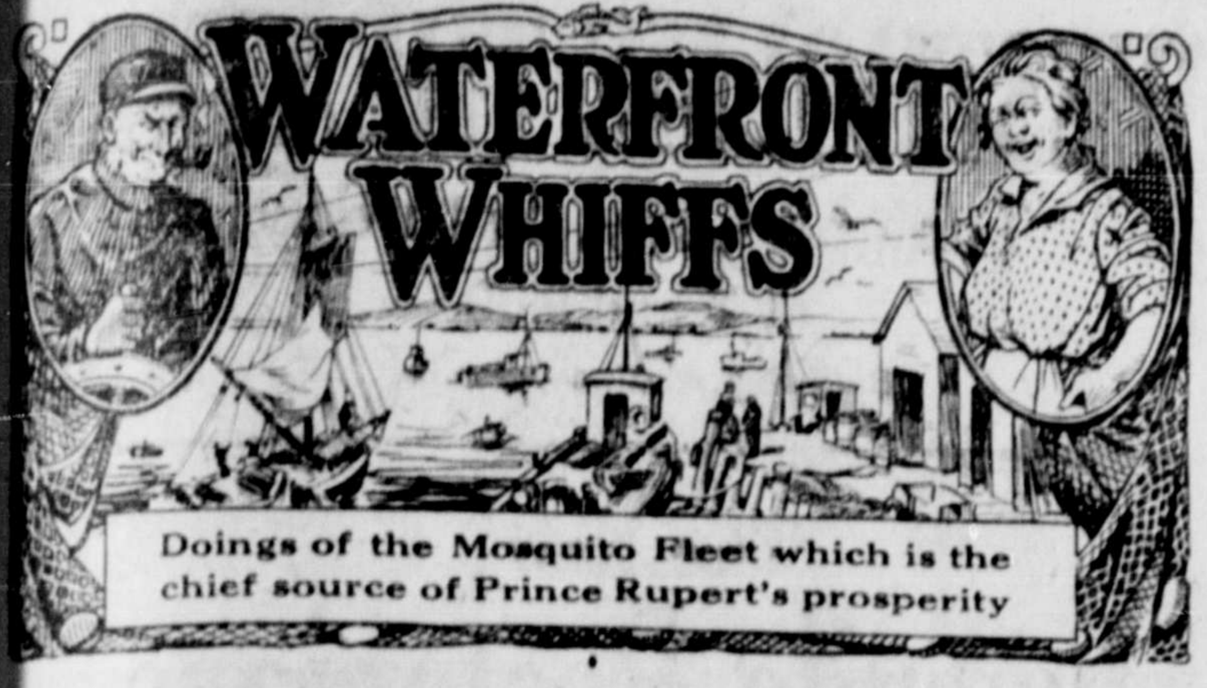
Doings of the Mosquito Fleet which is the chief source of Prince Rupert's prosperity