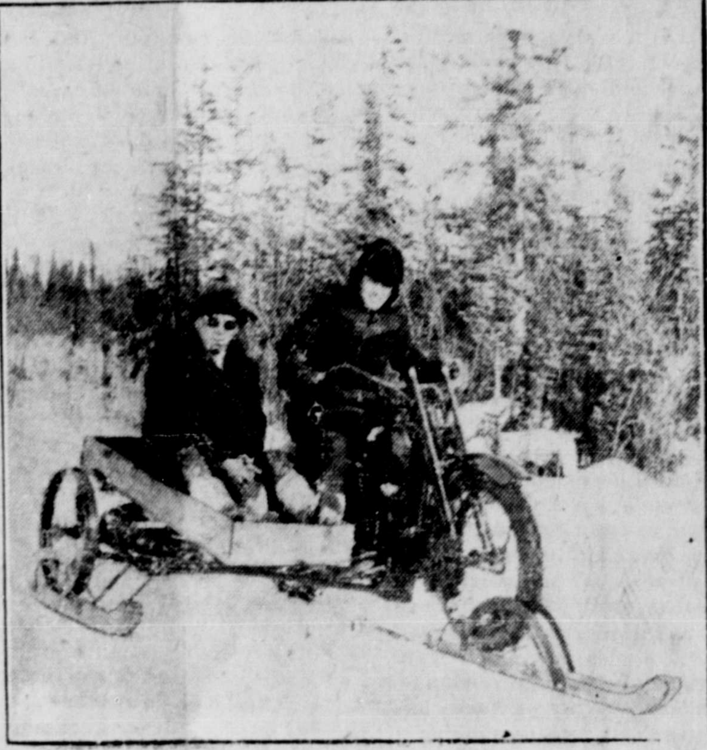
Modern transportation in the Yukon. A motorcycle on runners, propelled by a chain-covered wheel, covers a 275-mile trip in fourth of the time taken by a four-horse team.

Bandits Herd Employees Into Basement and Escaped With Large Amount of Loot NEW YORK, Aug. 7.—Five robbers today held up the store and factory of the Harry Bleiweis Co., manufacturing furriers, herded six employees into the basement and escaped with furs valued at $100,000.