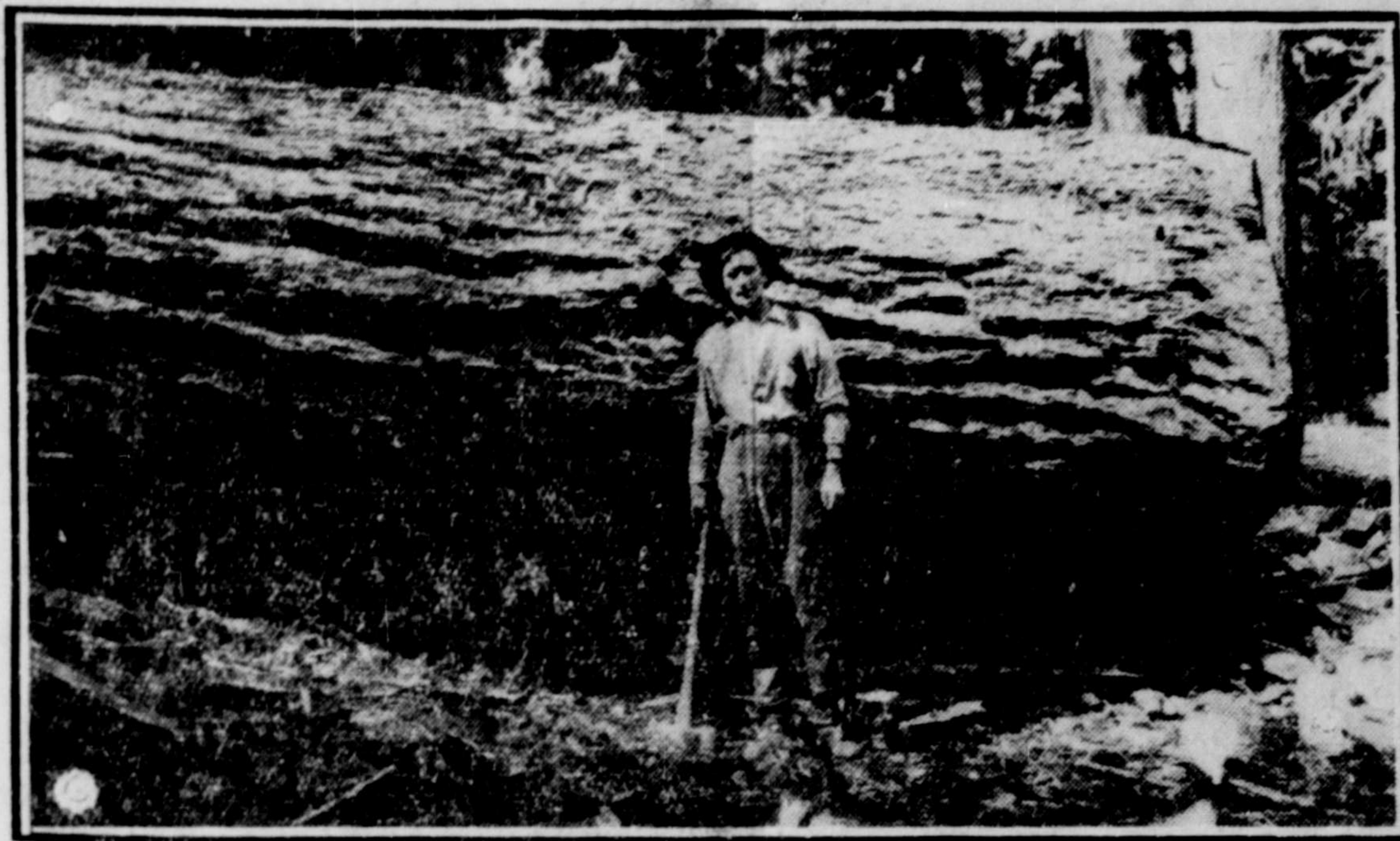
One of the big trees that make the Pacific Coast Province famous.