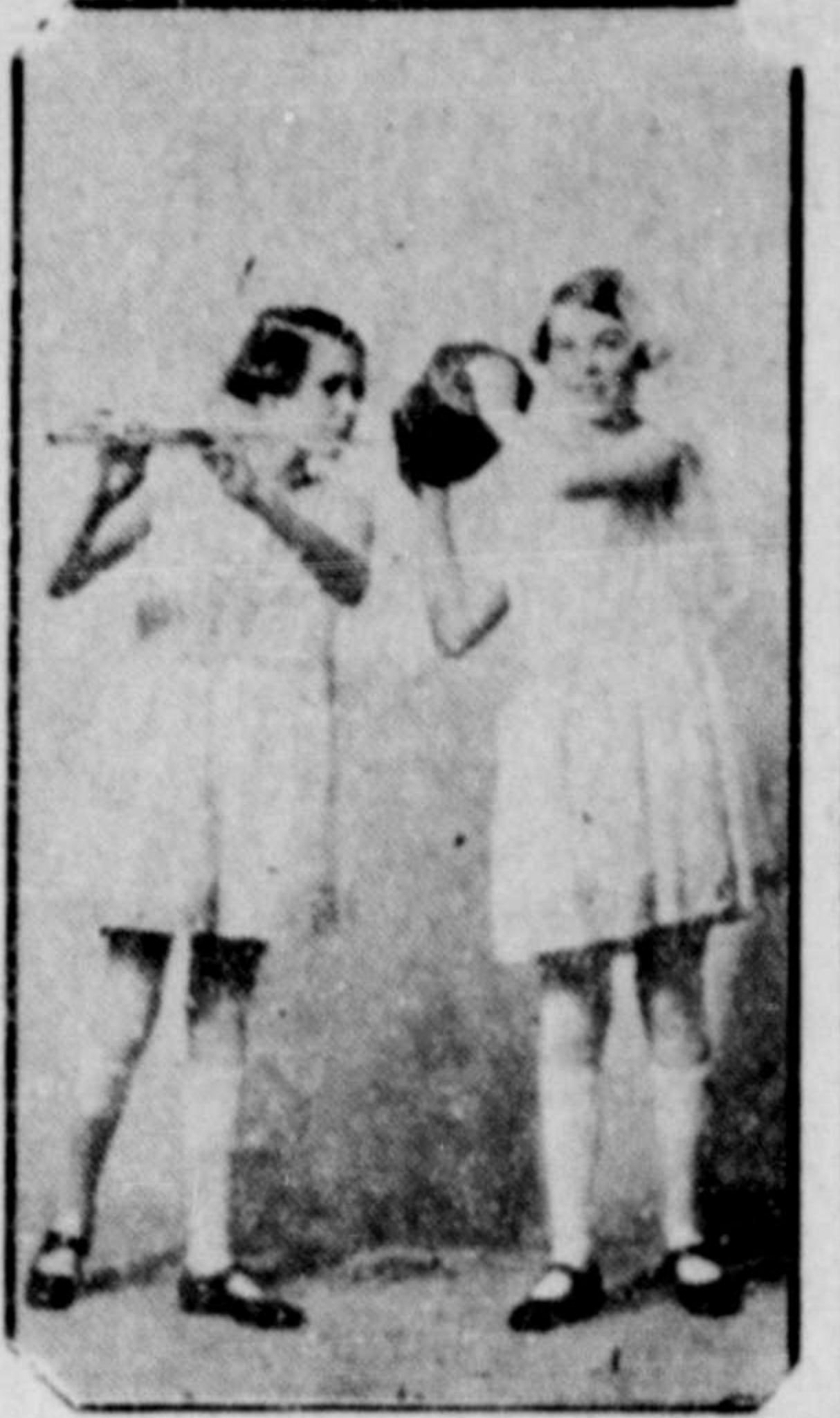
The Bostonians—In High Class Vaudeville, Westholme Theatre, Tonight.