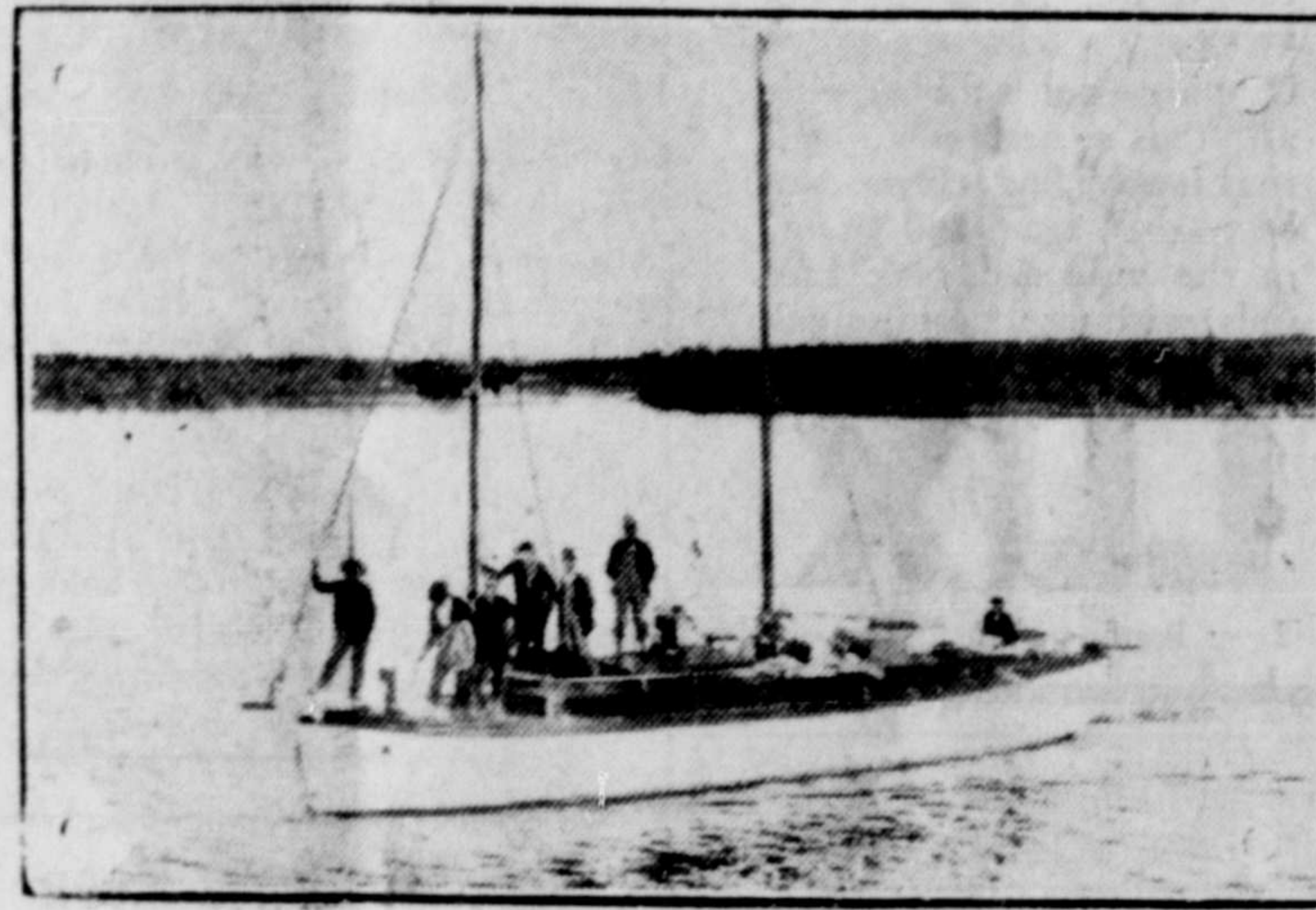
This Hudson's Bay Company's auxiliary cruiser, Lac du Brochet, used for transporting freight on Reindeer Lake in Northern Manitoba and Saskatchewan, has a capacity of twelve tons

TORONTO, Aug. 10.—Six deaths from drowning were re- ported in Ontario on Sunday.