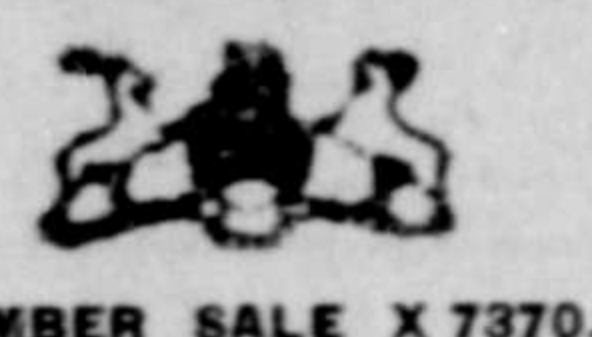
TIMBER SALE X 7370.

Before work began on the St. Die world map, the poet had made a translation of Amerigo Vespucci's report of his voyages and had indited a sonnet on the mysteries of the new-found world and the feats of Columbus, Cabra and Vespucci. From the first he was enchanted by the meter and melody of the name "Amerigo," which, translated into Latin, became America. Recently Discovered Lands Waldseemuller's plates were